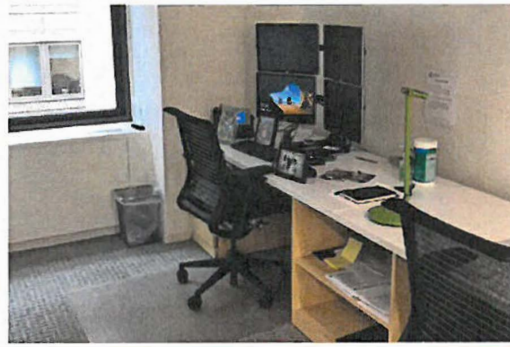
Partial 12A Floor - 6,832 rsf