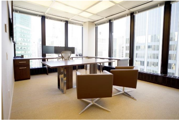
Chairman's Corner Office

Exclusive Sublease Listing Perfect for Chairman's / CEO / Family Office 37th fl. NW Corner