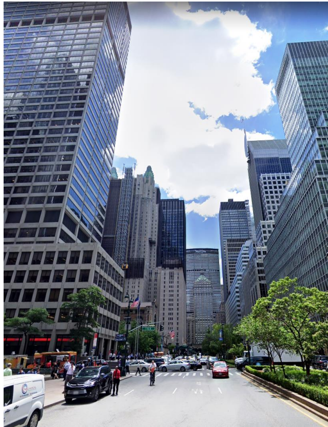
Park Avenue (Plaza District)