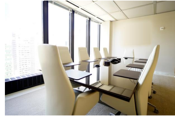
Boardroom with Unencumbered Views

This landmark building property stands 515 feet (157 m) tall, a modernist masterpiece of architecture. The property today attributes its enduring appeal to its world renowned architectural features, robust infrastructure, famous fountains and plaza and the Park Avenue location.