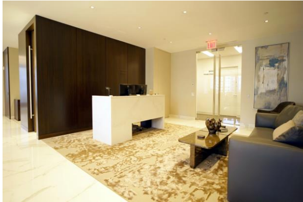
Reception with Guest Seating