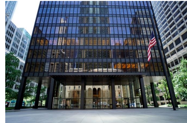
Seagram's Building Plaza