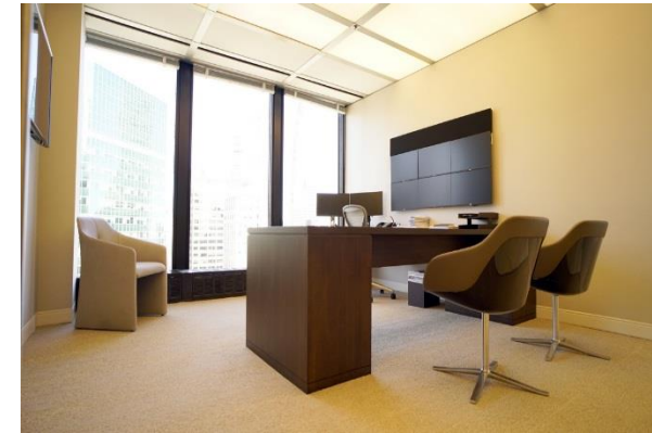
Partner's Private Office