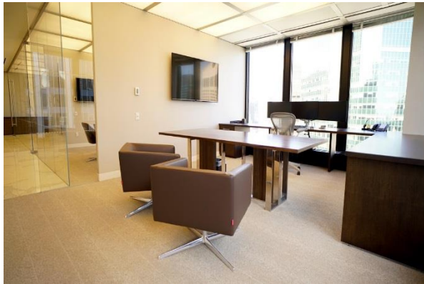
Chairman's Corner Office Picture

Exclusive Sublease Listing Perfect for Chairman's / CEO / Family Office 37 th fl. NW Corner