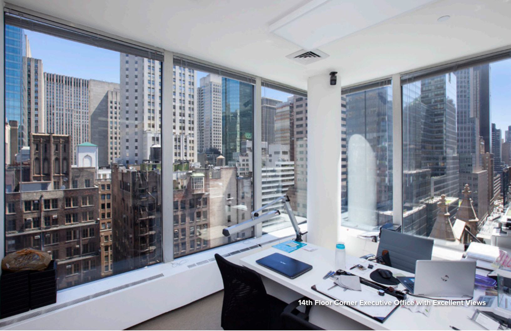
14th Floor Corner Executive Office with Excellent Views