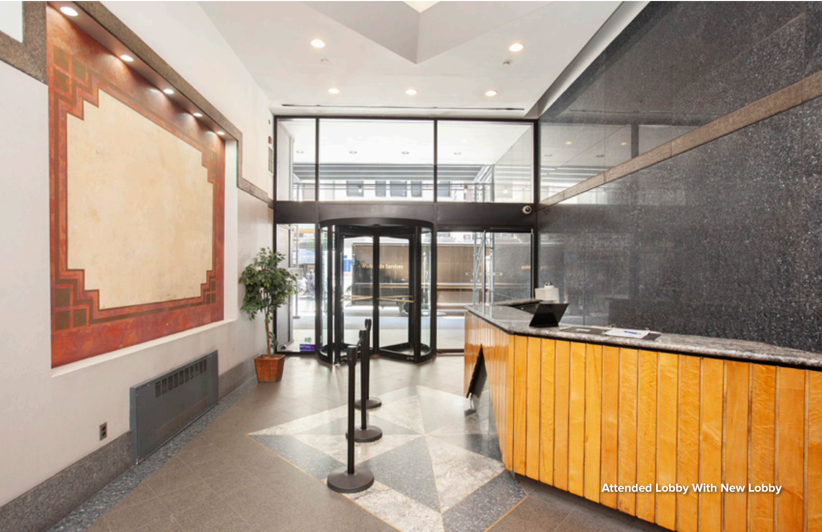
Attended Lobby With New Lobby