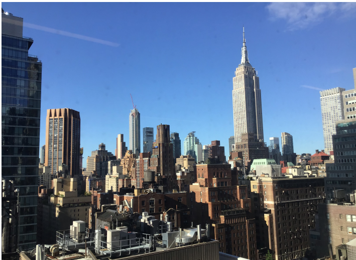
VIEW FROM THE 18TH FLOOR