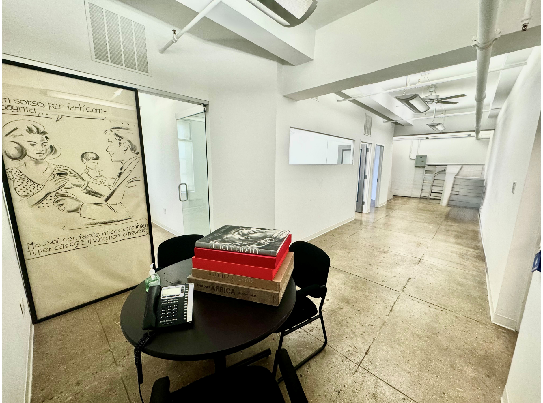
350 7th Avenue, Suite 1702 1,550 rentable sq. ft.