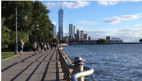
Hudson River Park