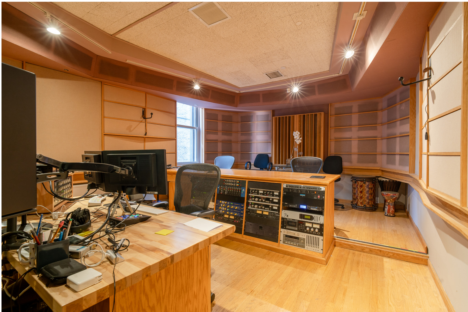
928 Broadway-Flatiron District Recording Studio For lease