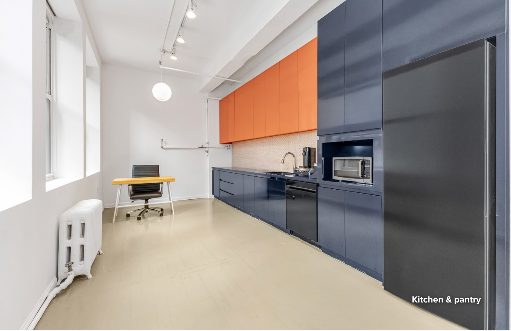
Kitchen & pantry