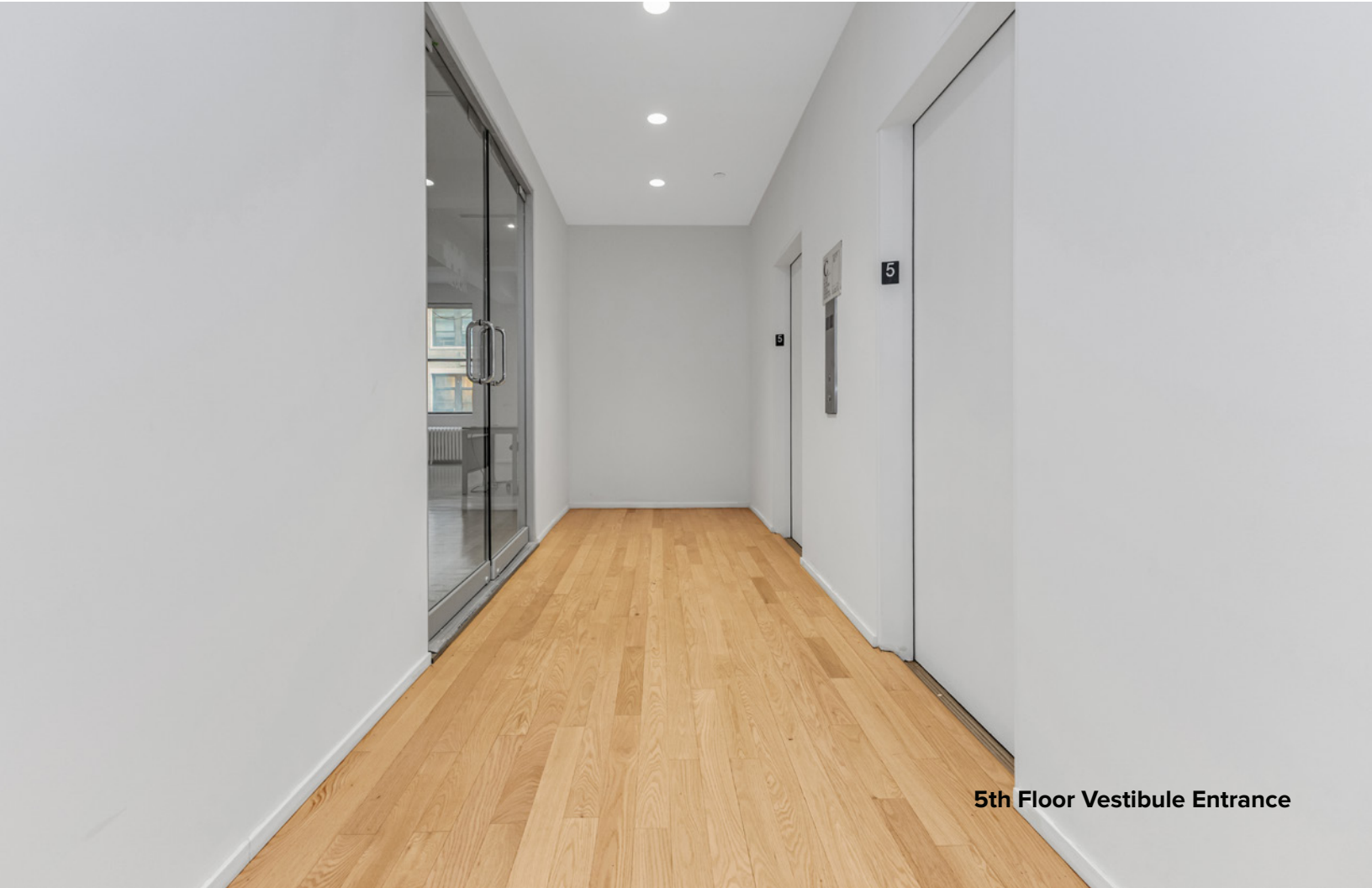
5th Floor Vestibule Entrance