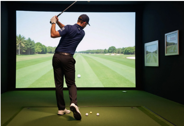
FIVE IRON GOLF

Work on your swing at the Five Iron Golf indoor urban golf experience.