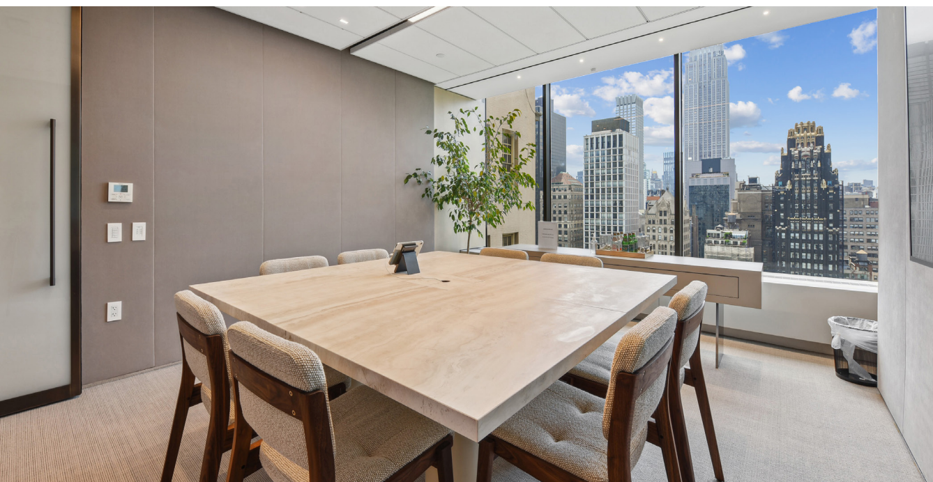
Photos of 20th Floor space The 21st Floor will have substantially similar finishes