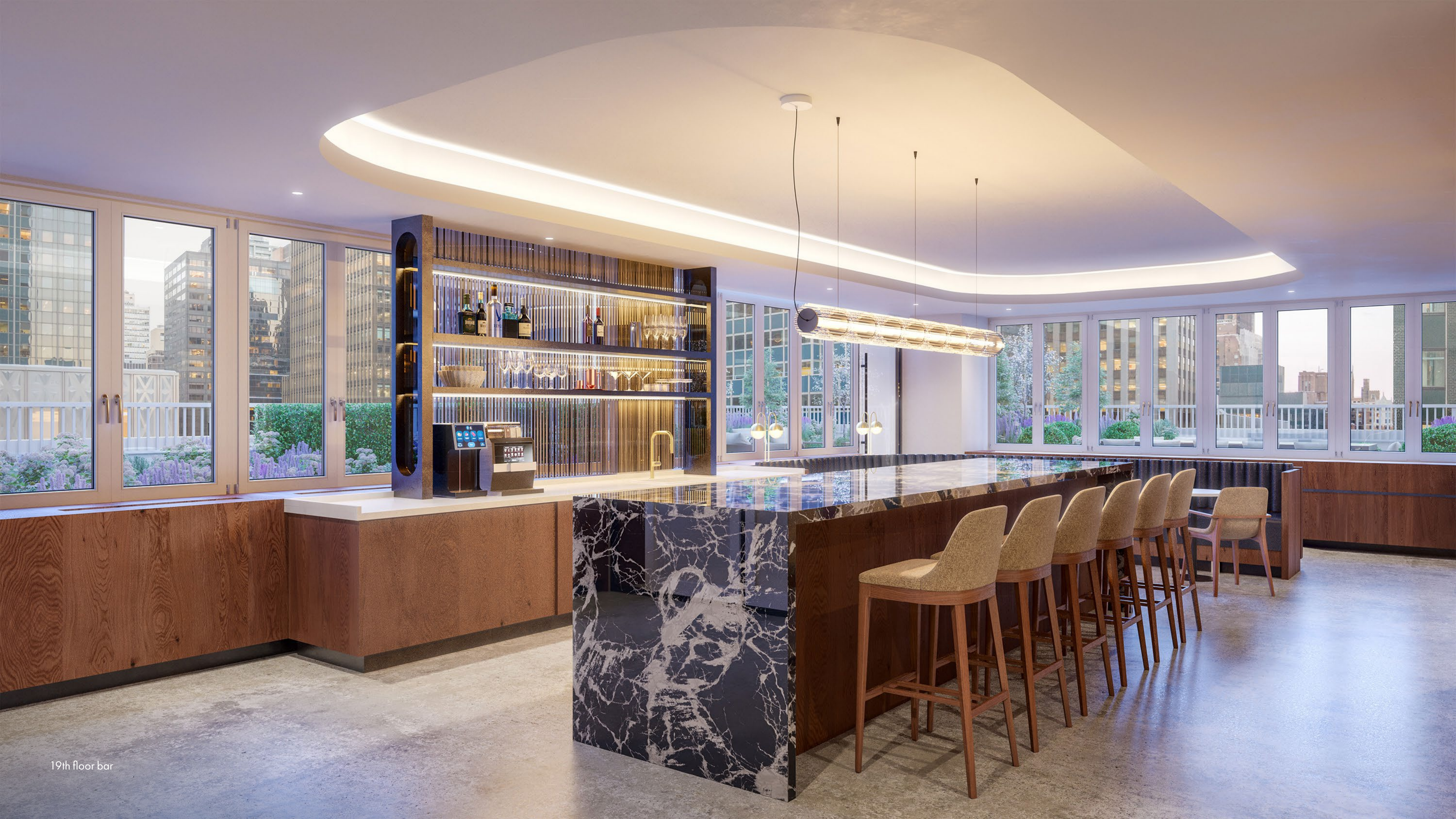
19th floor bar