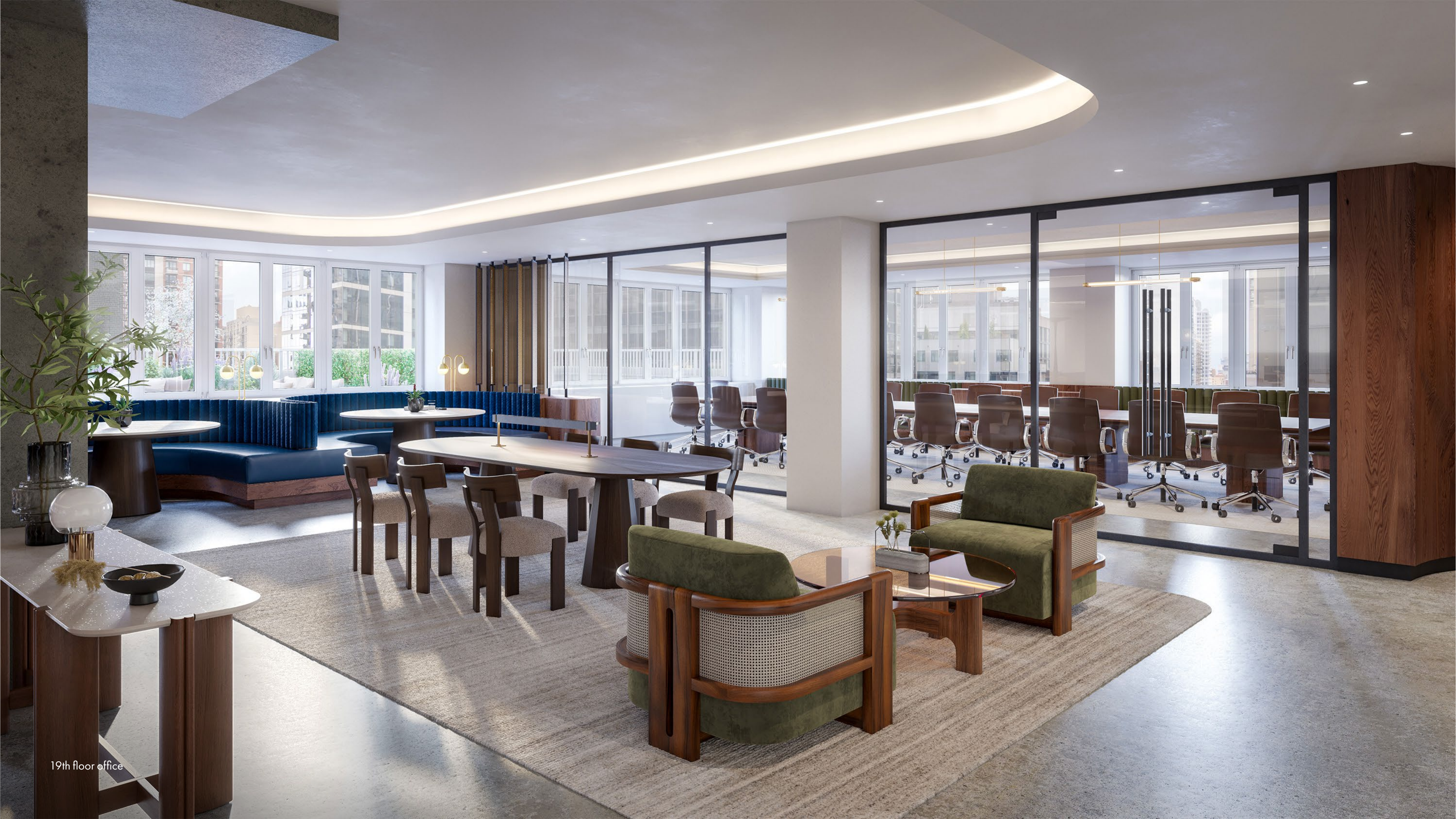
19th floor office