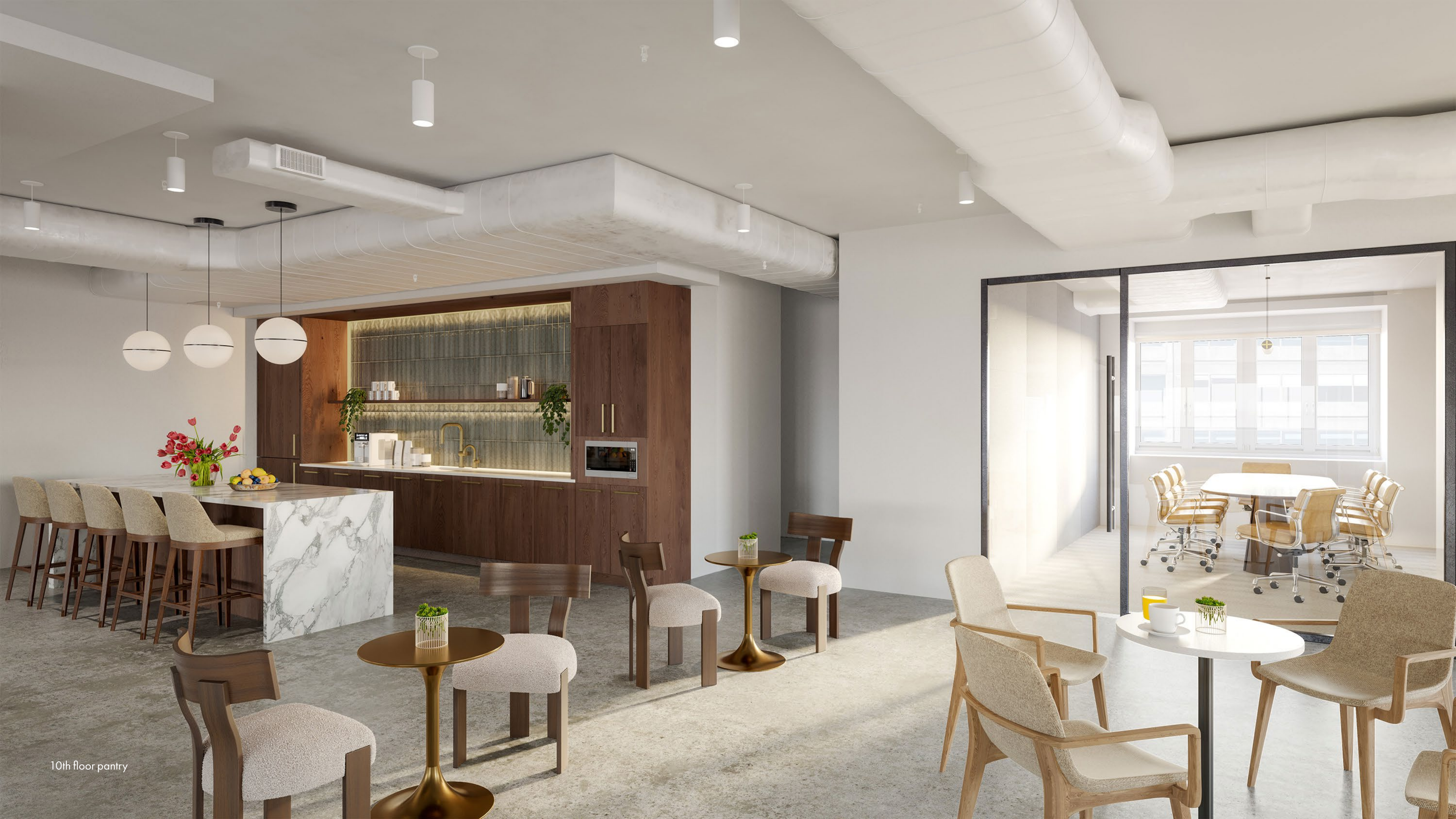
10th floor pantry