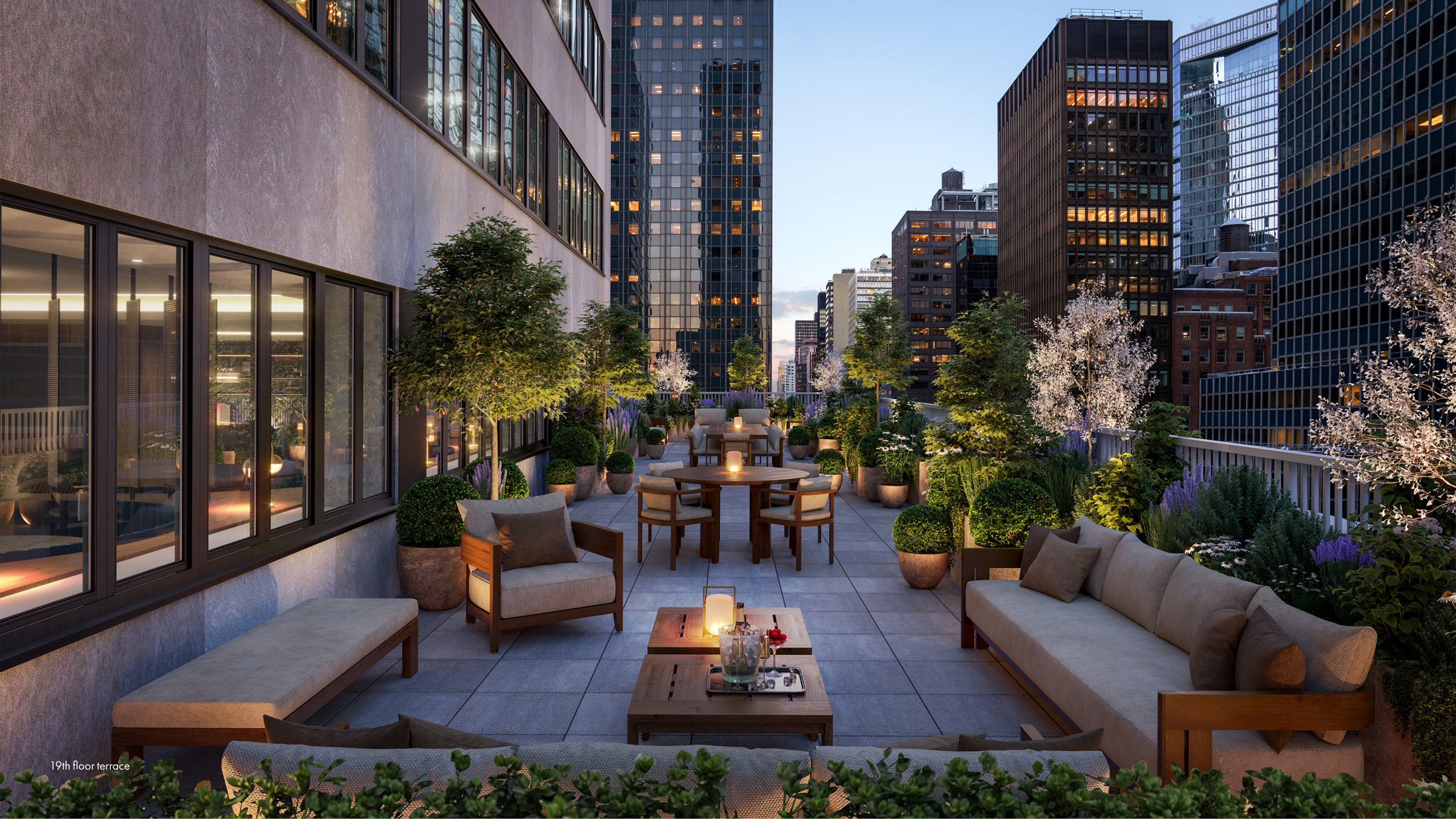
19th floor terrace