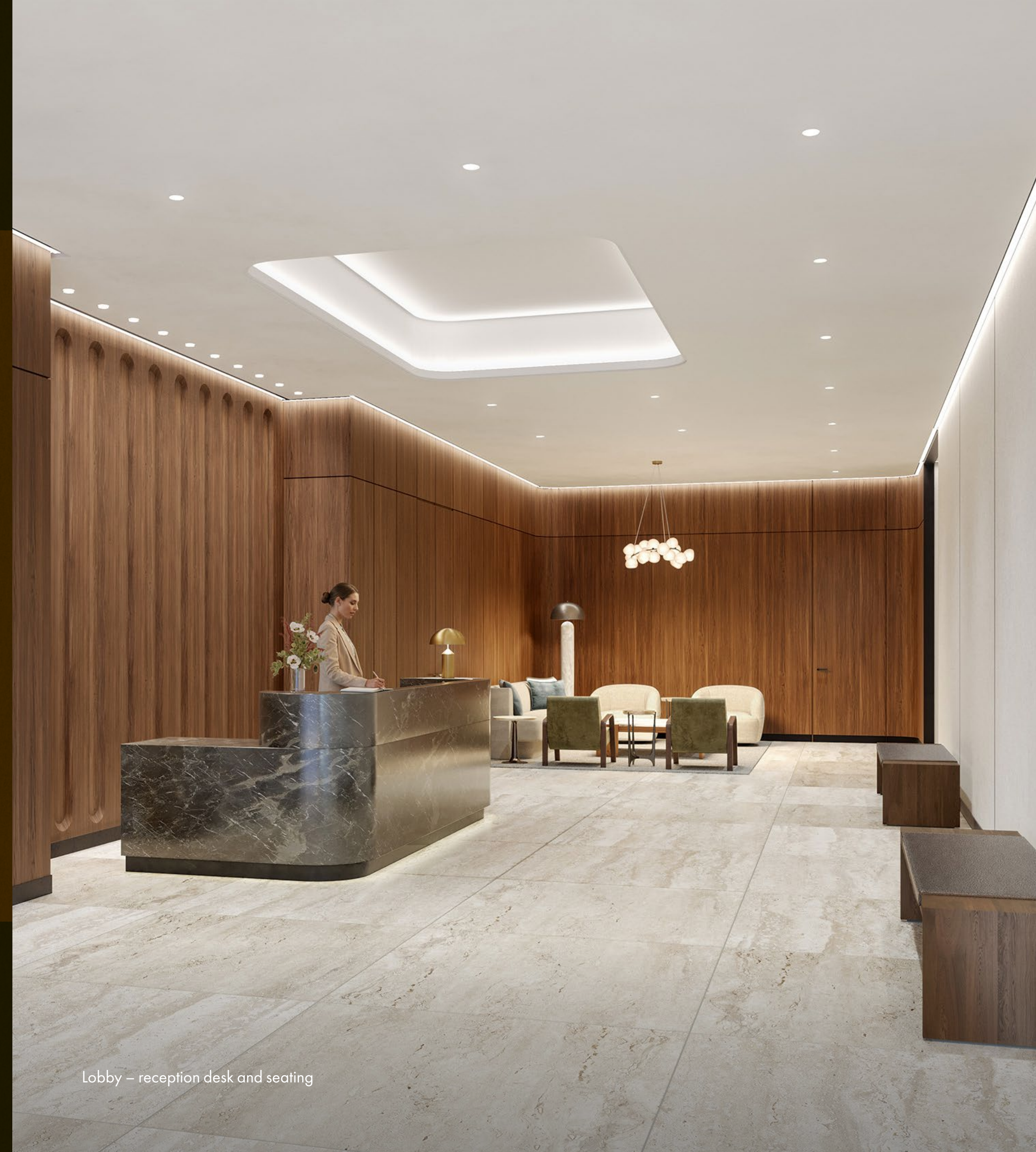
Lobby – reception desk and seating

630 Third Avenue's inviting new canopied entrance leads into an elegantly reimagined lobby which includes a custom marble reception desk with warm wooden panelling, and a welcoming soft seating area for visitors.