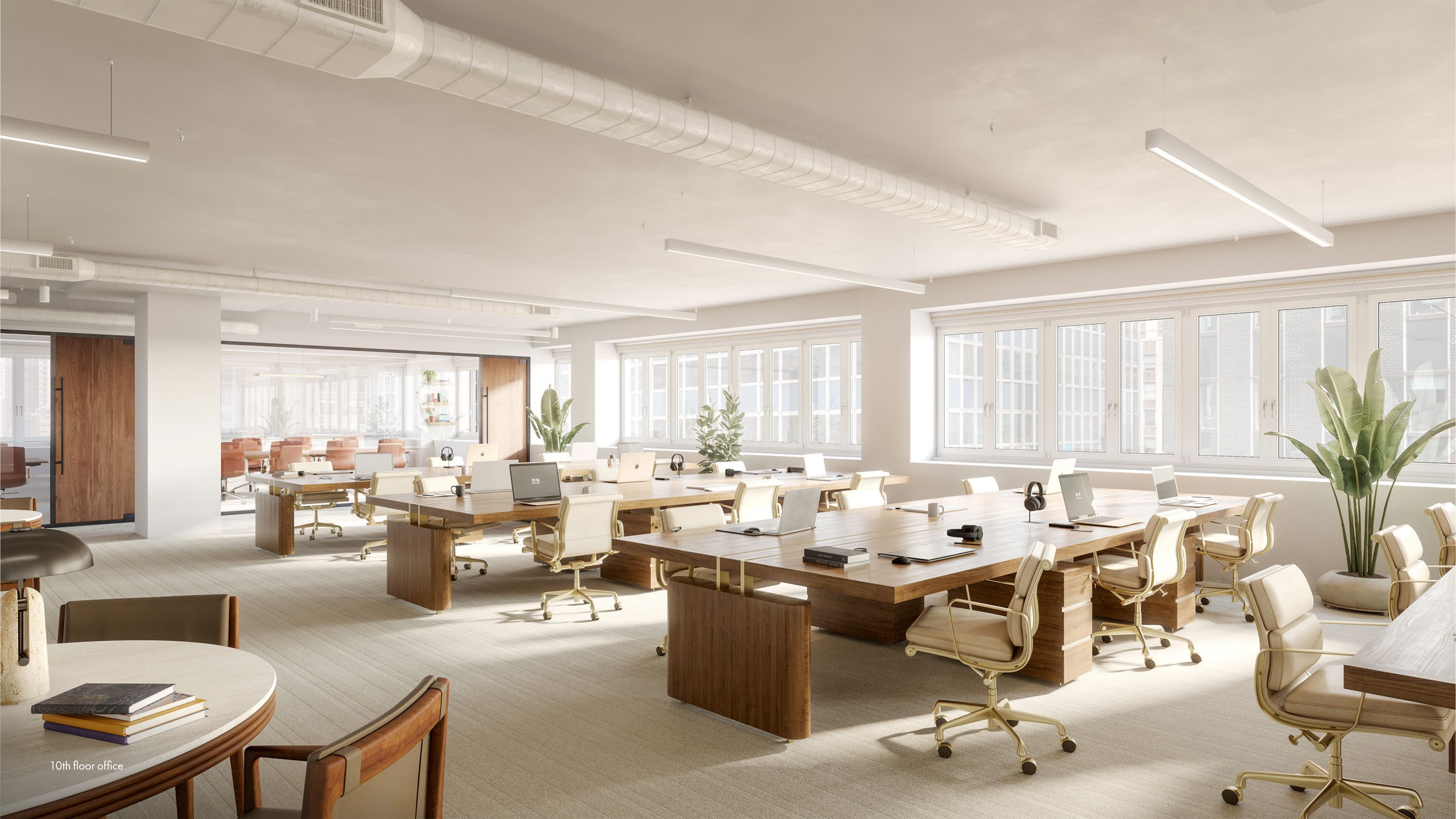
10th floor office