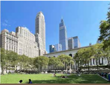
Blocks from Bryant Park