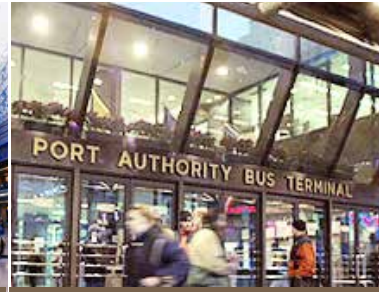
Port Authority Bus Terminal