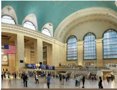
Walk to Grand Central Terminal