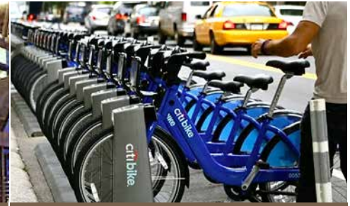
CitiBike Stations Nearby