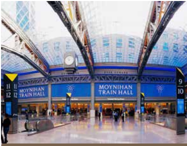
Moynihan Train Hall