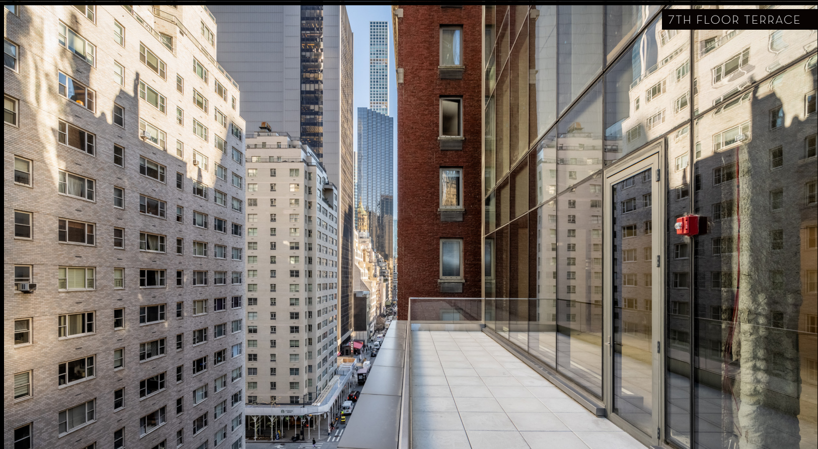
7TH FLOOR TERRACE