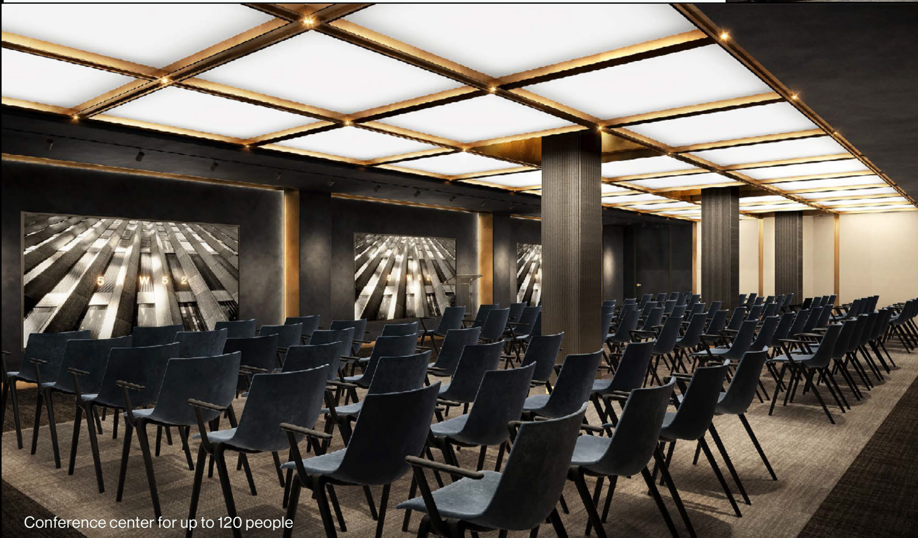
Conference center for up to 120 people