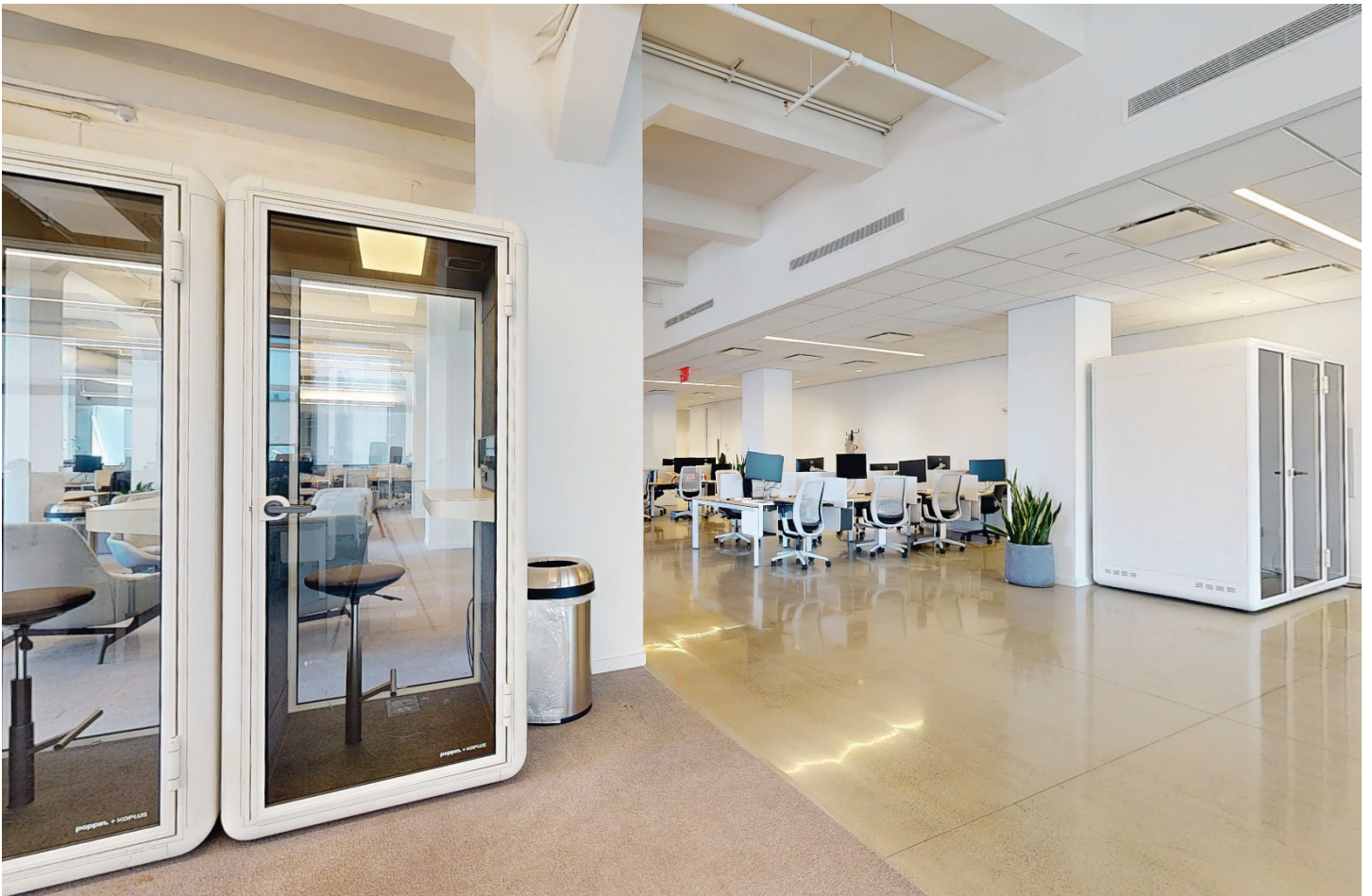
5 Penn Plaza, New York, NY 10001