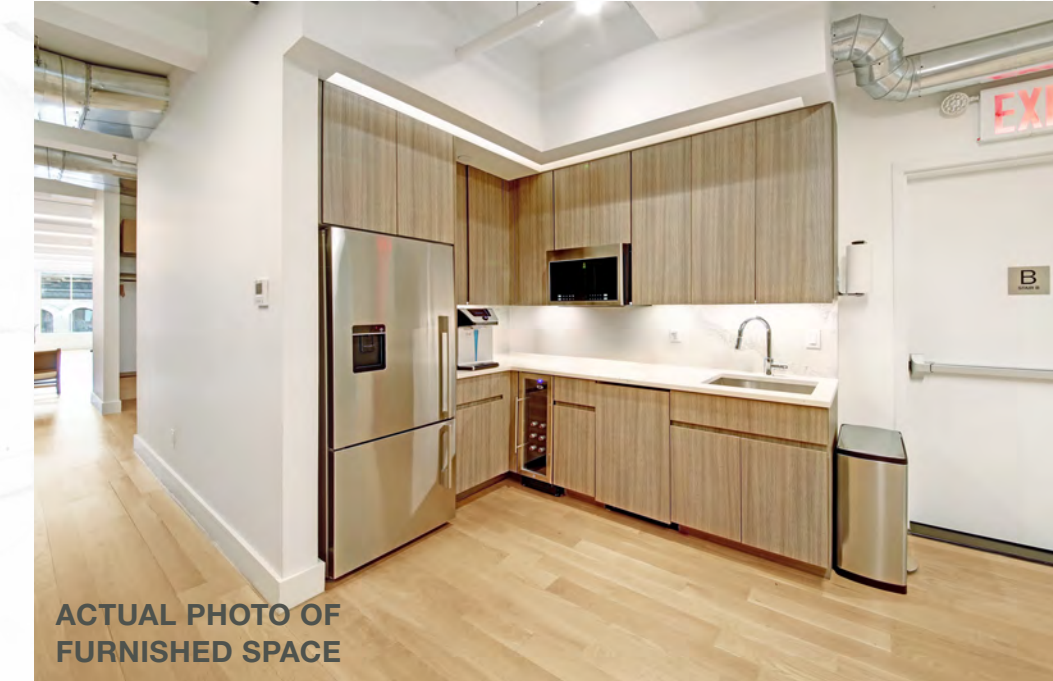
ACTUAL PHOTO OF FURNISHED SPACE

COMPLETED CAPITAL IMPROVEMENTS COMMON AREAS + WIDE PLANK OAK FLOORS + EXPOSED BRICK NEW BATHROOMS ATTENDED LOBBY + ON-SITE SUPER BIKE STORAGE