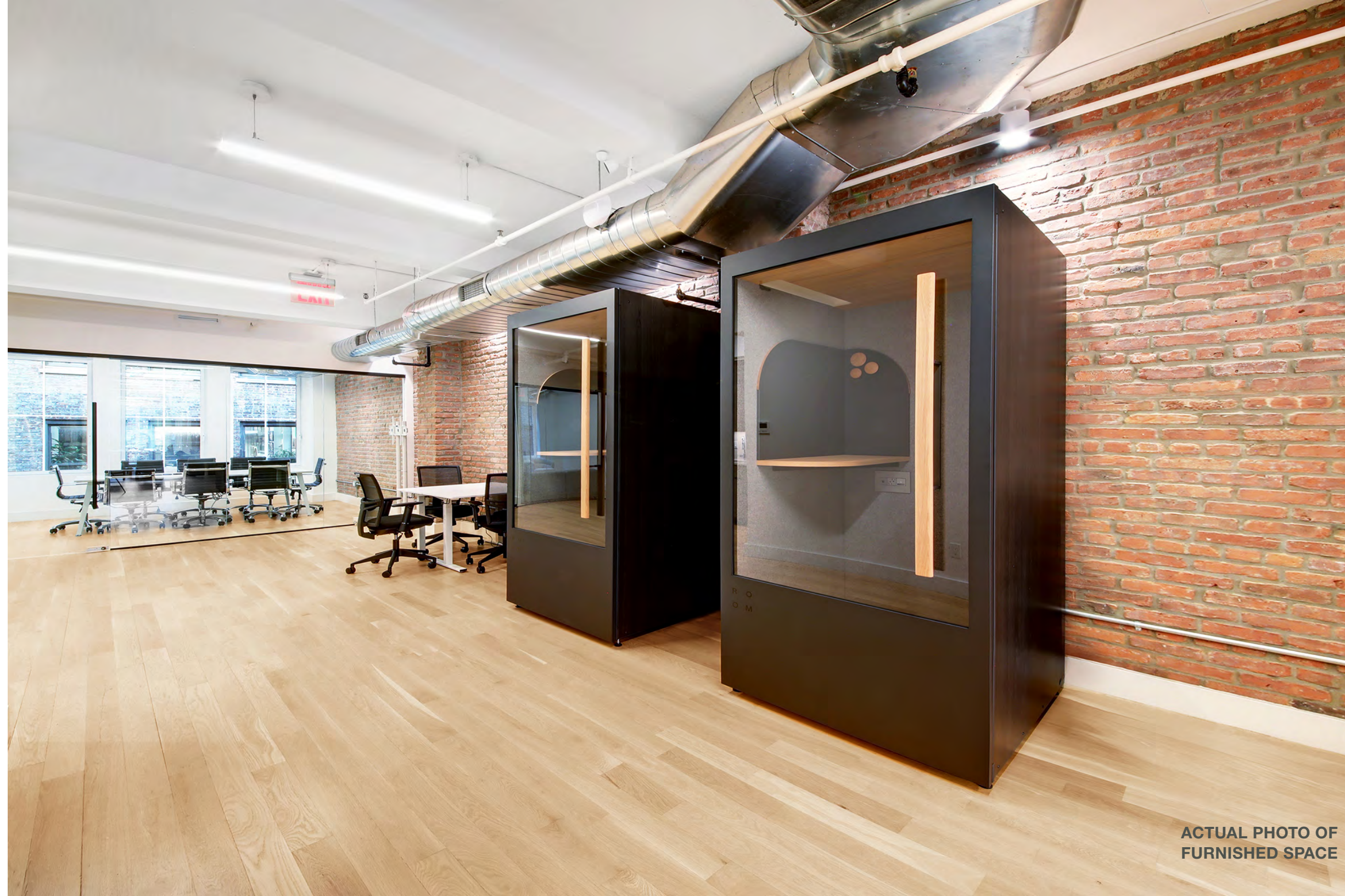
ACTUAL PHOTO OF FURNISHED SPACE

UPDATED ELECTRIC DEDICATED TELEDATA LINES TENANT CONTROLLED HVAC WIRED FOR FIOS 10'5" CEILING HEIGHTS