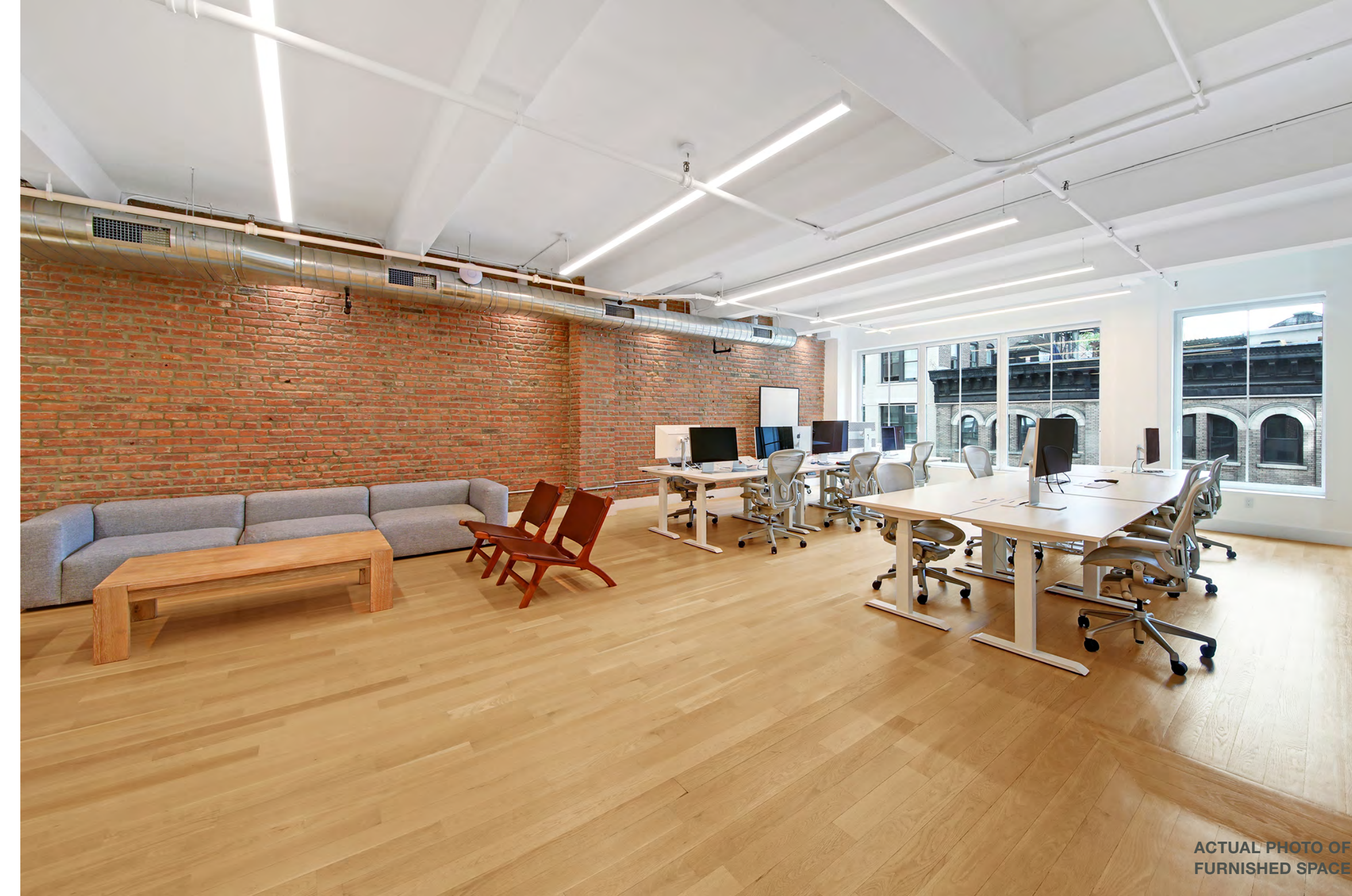
ACTUAL PHOTO OF FURNISHED SPACE