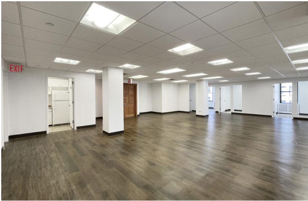
Entire 11th Floor