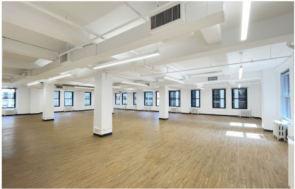
Entire 12th Floor