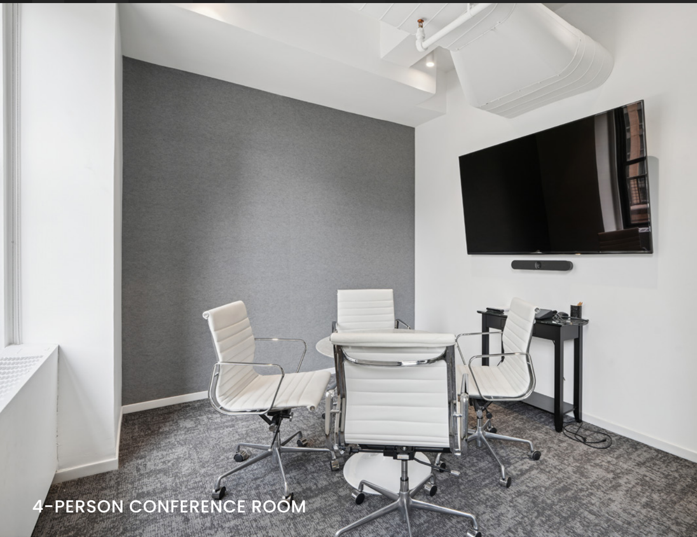
4-PERSON CONFERENCE ROOM