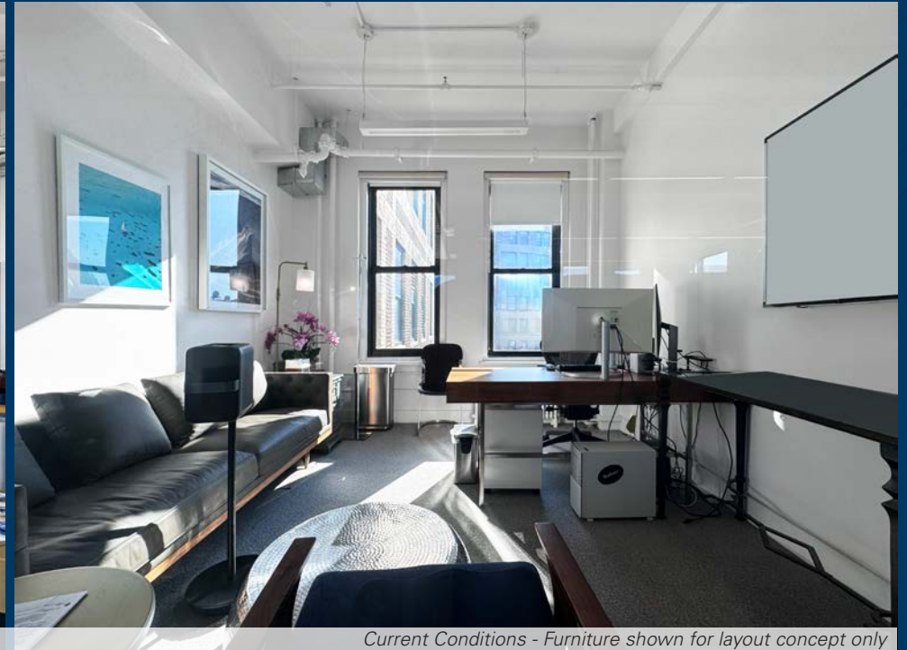
Current Conditions - Furniture shown for layout concept only