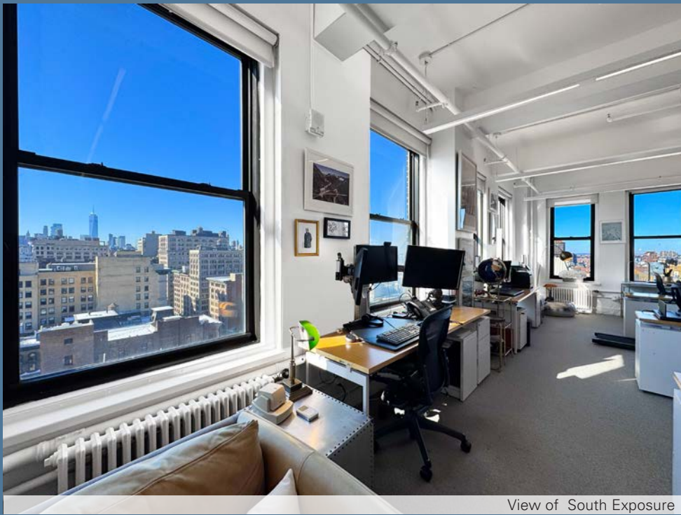
View of South Exposure