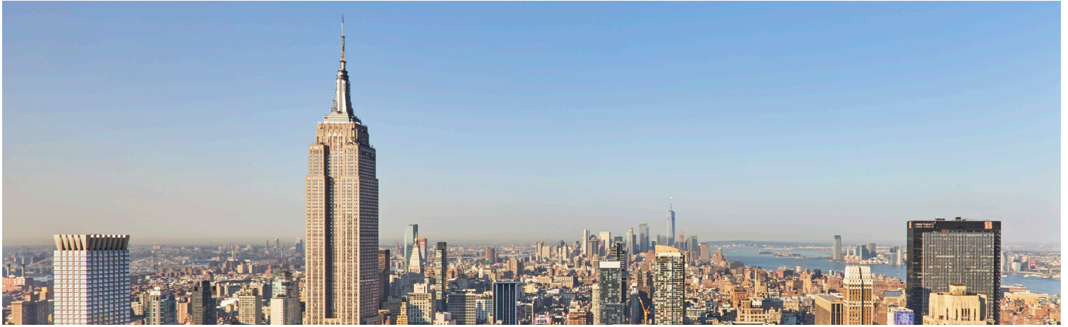
SOUTH FACING VIEW