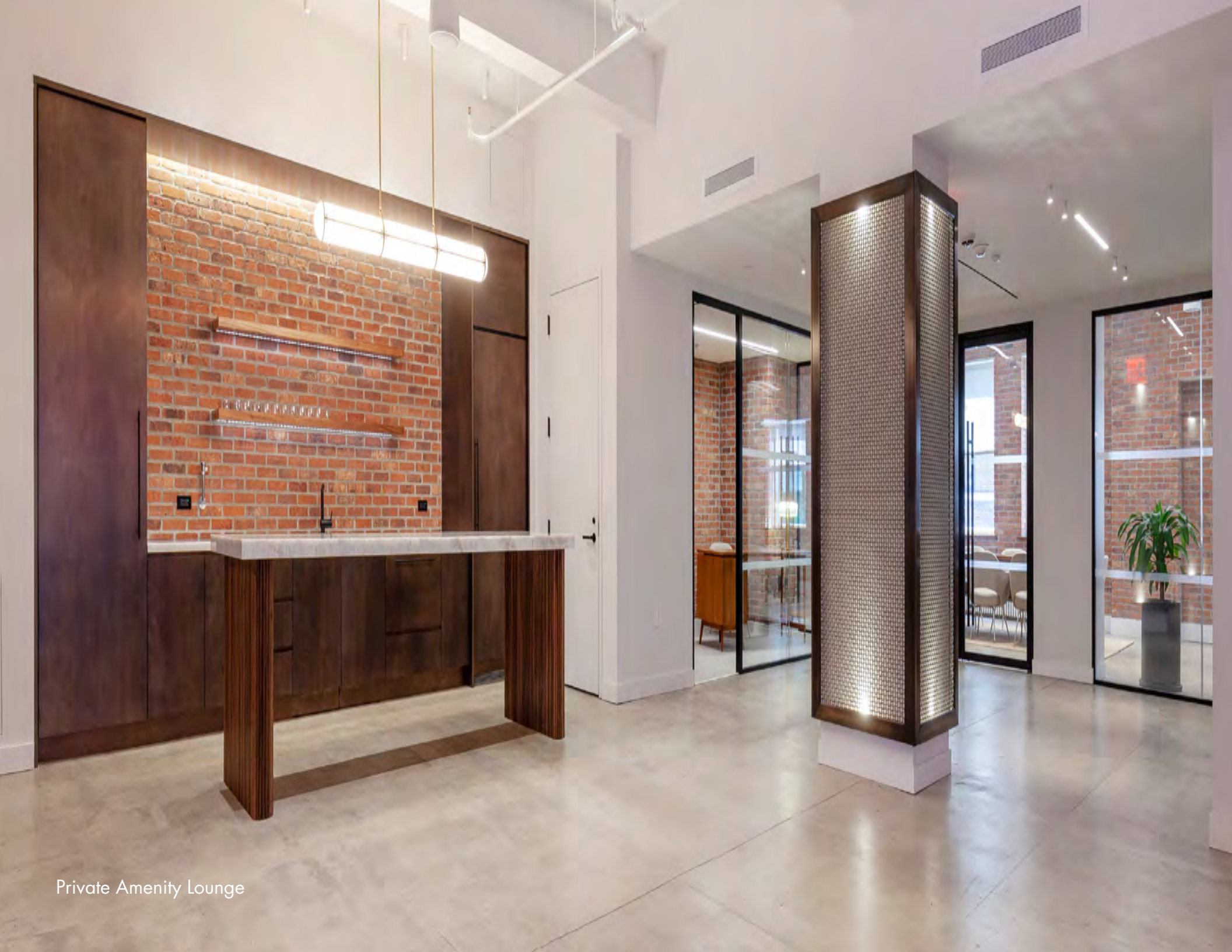
Private Amenity Lounge