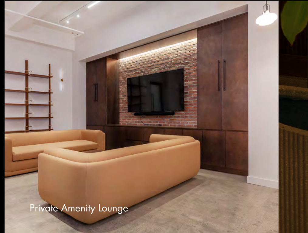
Private Amenity Lounge