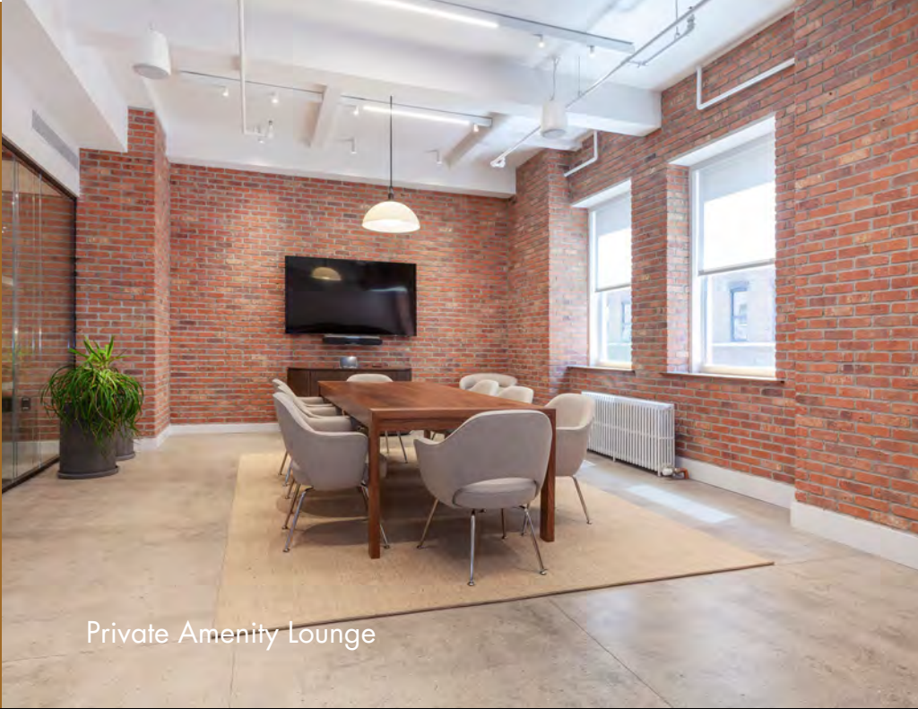
Private Amenity Lounge