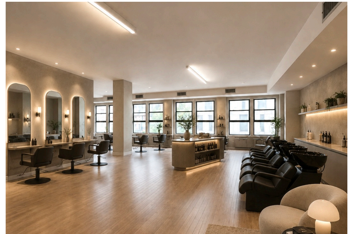
Select renderings highlight multiple design directions, demonstrating the potential to deliver a highly considered, elevated environment across a variety of concepts.