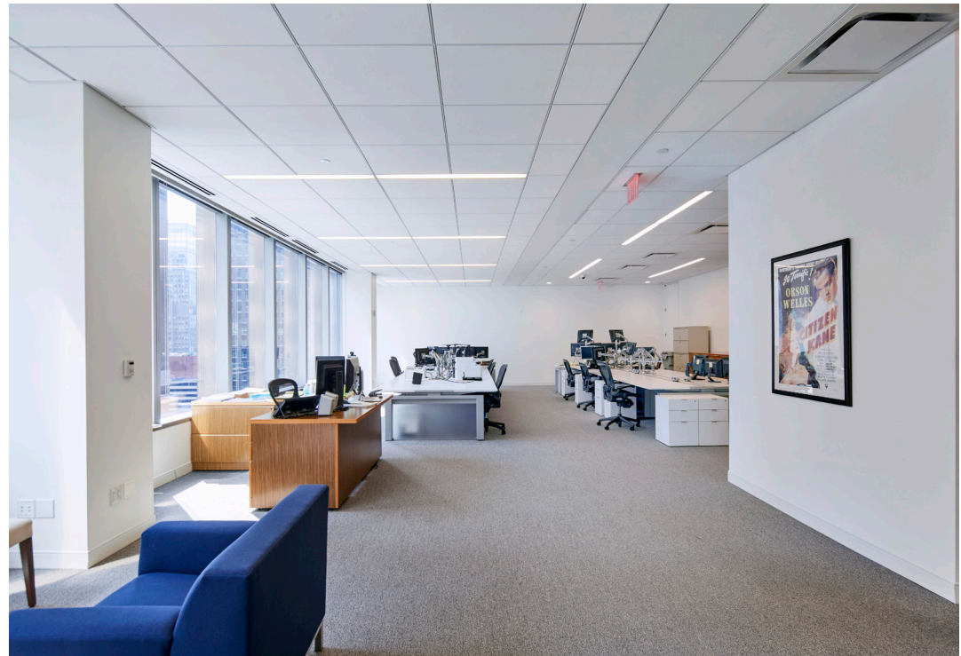
Partial 16th Floor — 4,905 RSF