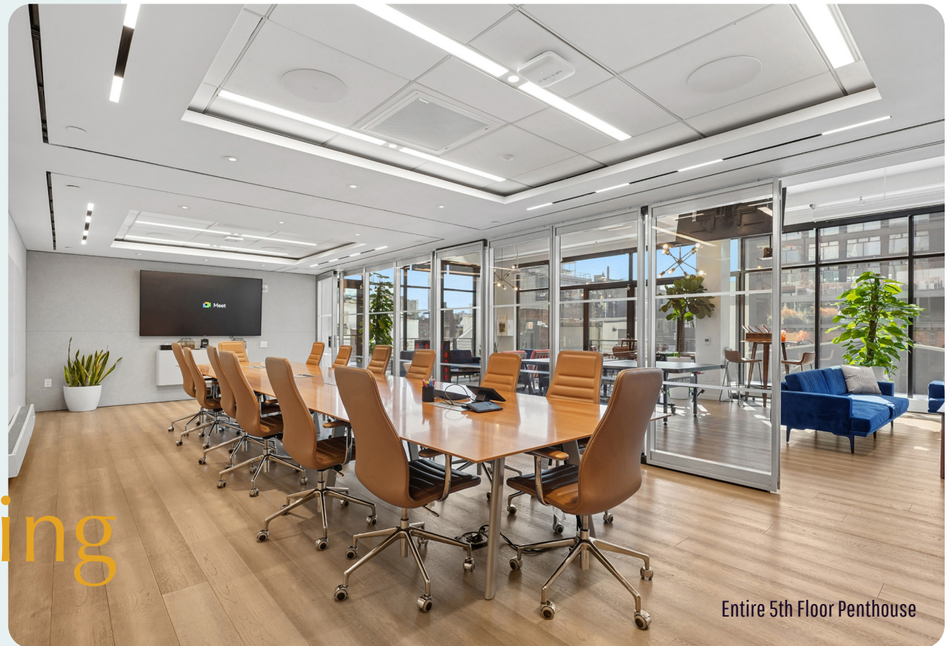
Entire 5th Floor Penthouse

Area/Premises Entire 3rd Floor: 33,192 RSF Entire 4th Floor: 10,496 RSF Entire 5th Floor (PH): 2,842 RSF Total: 46,530 RSF