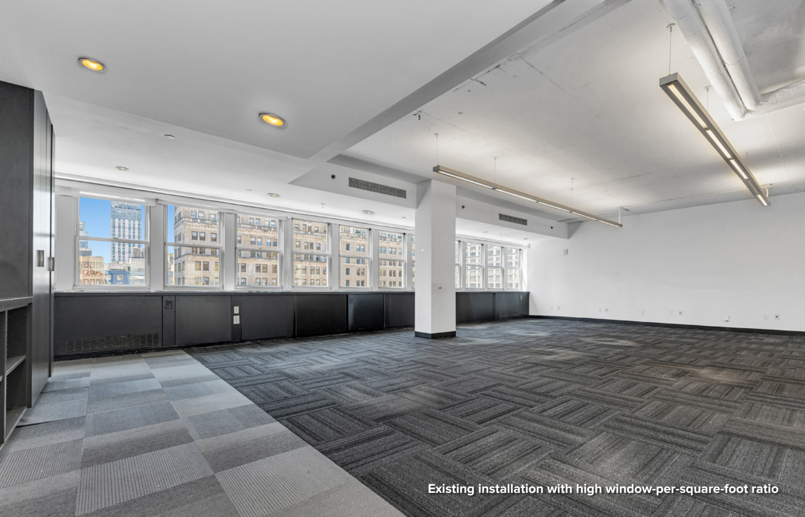
Existing installation with high window-per-square-foot ratio