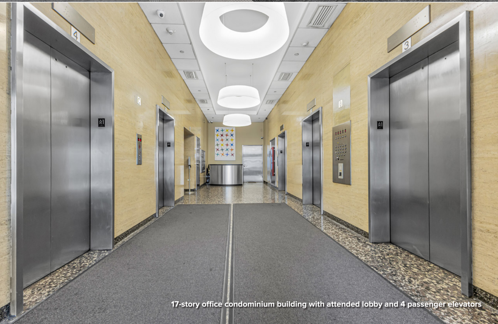
17-story office condominium building with attended lobby and 4 passenger elevators