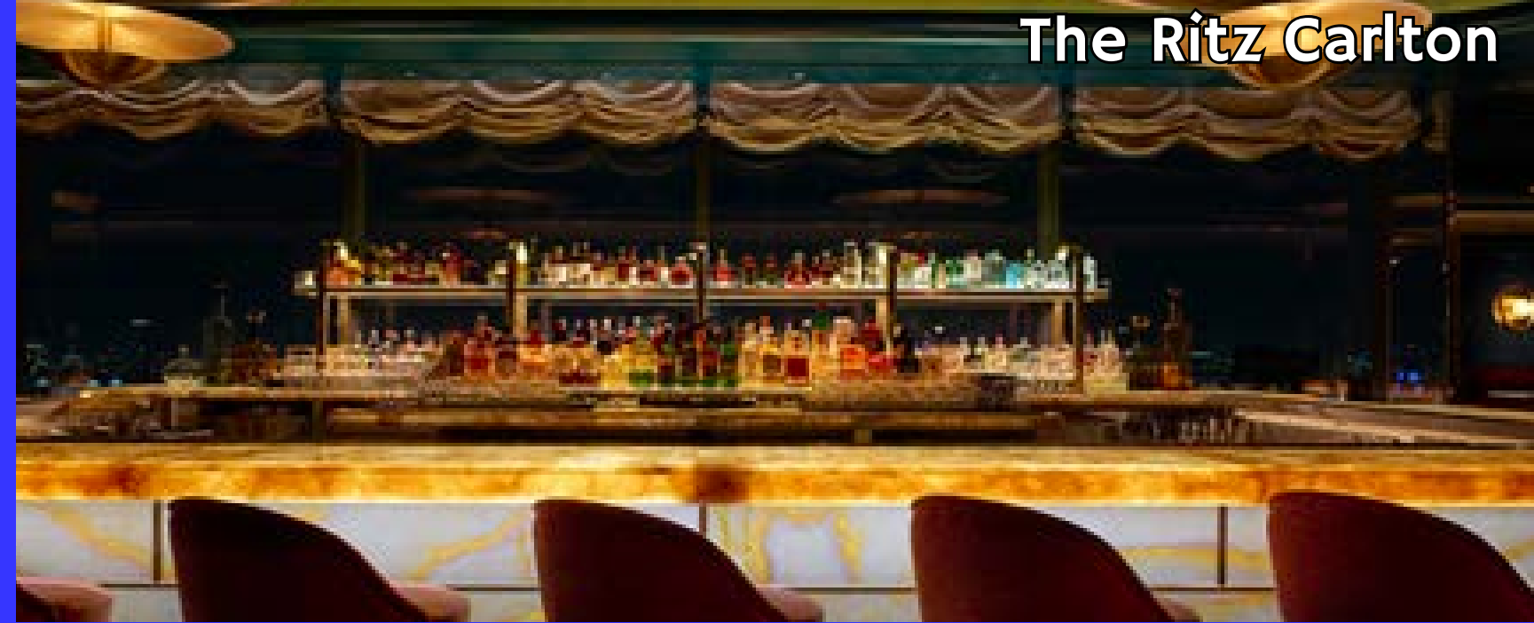
The Ritz Carlton