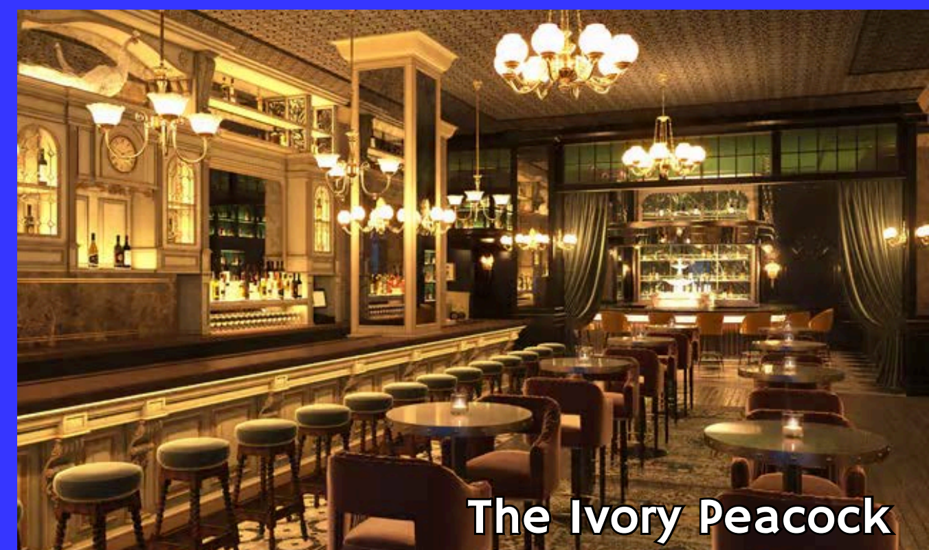
The Ivory Peacock