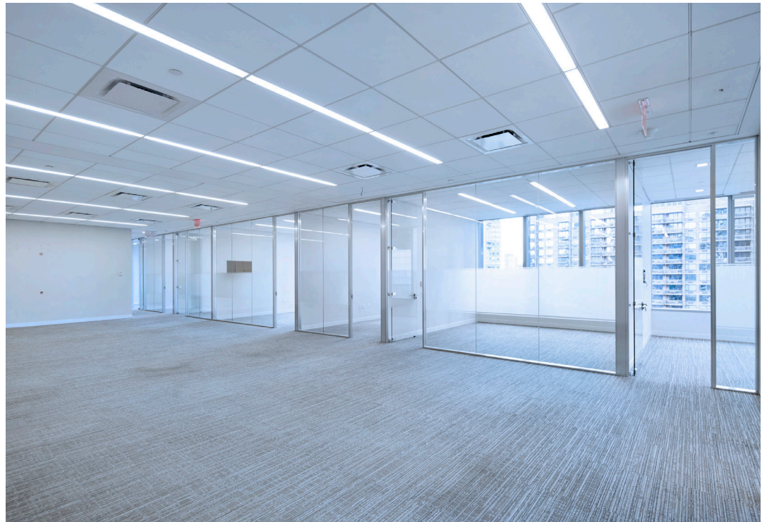
Partial 25th Floor — 7,499 RSF