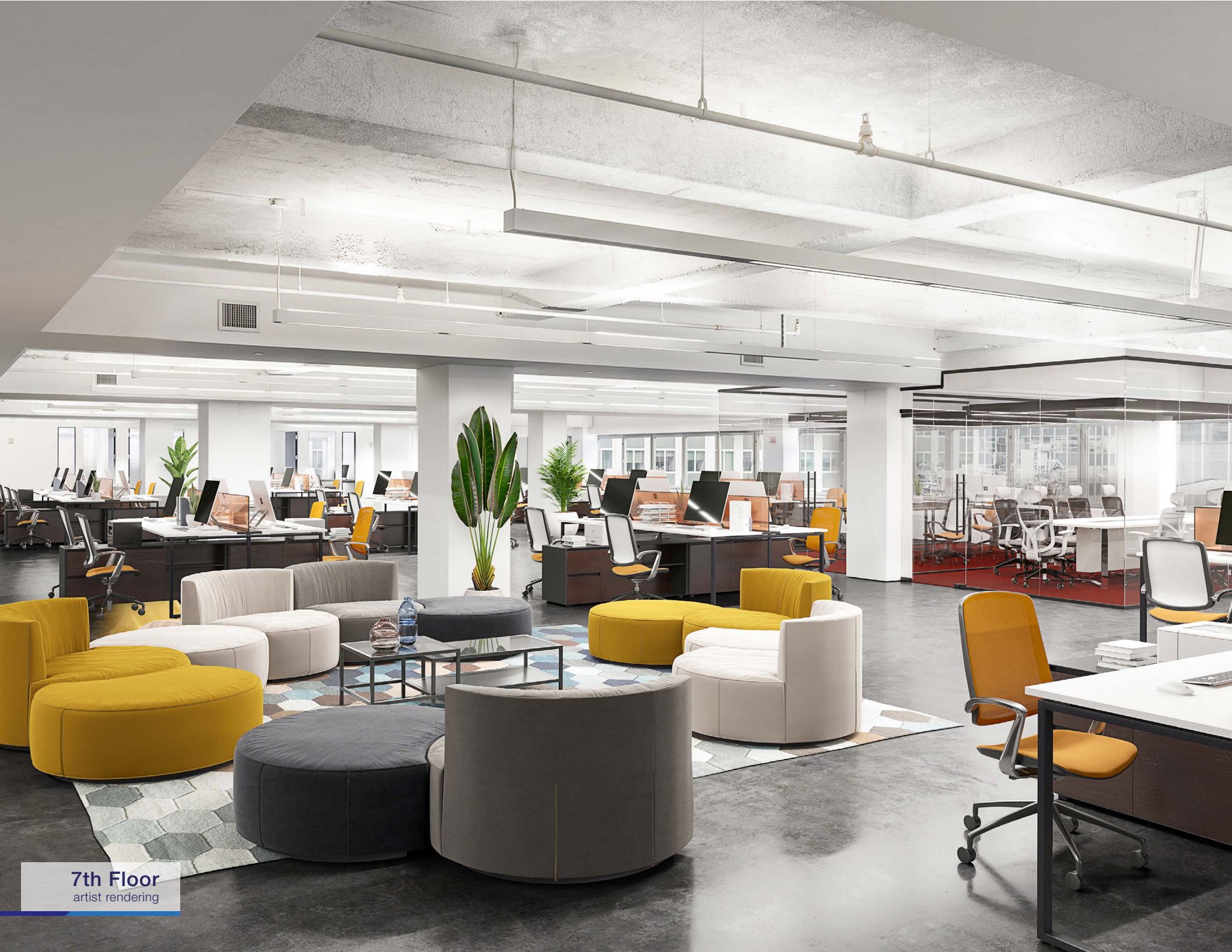
7th Floor artist rendering