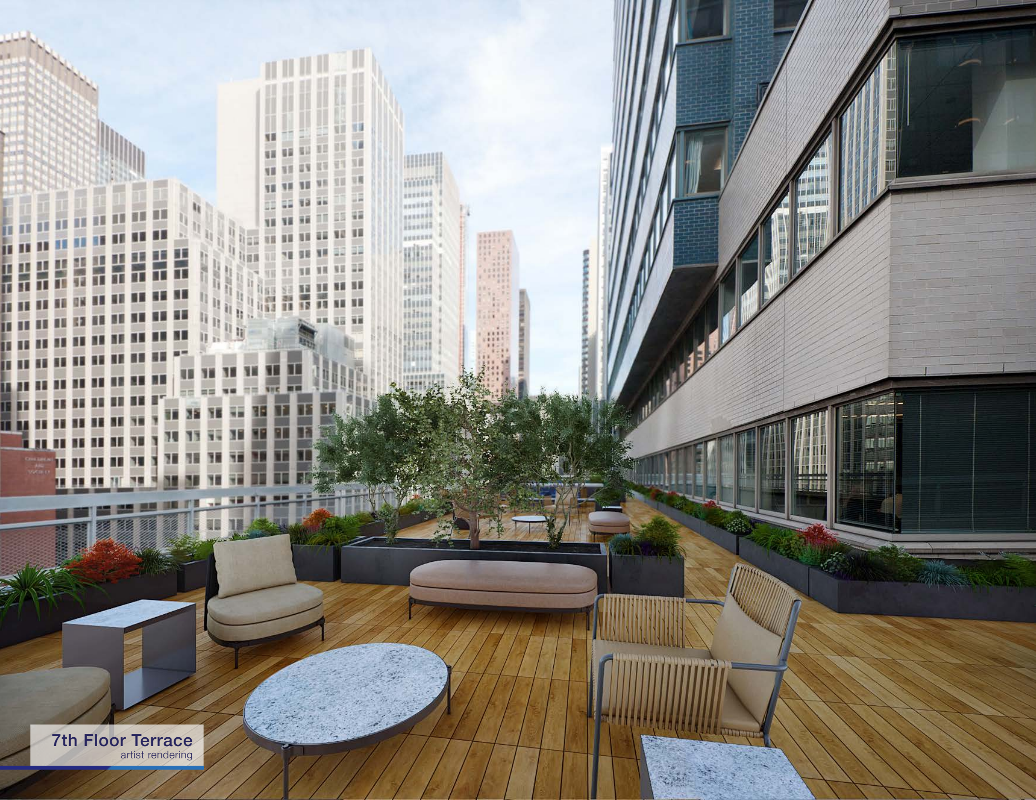
7th Floor Terrace artist rendering