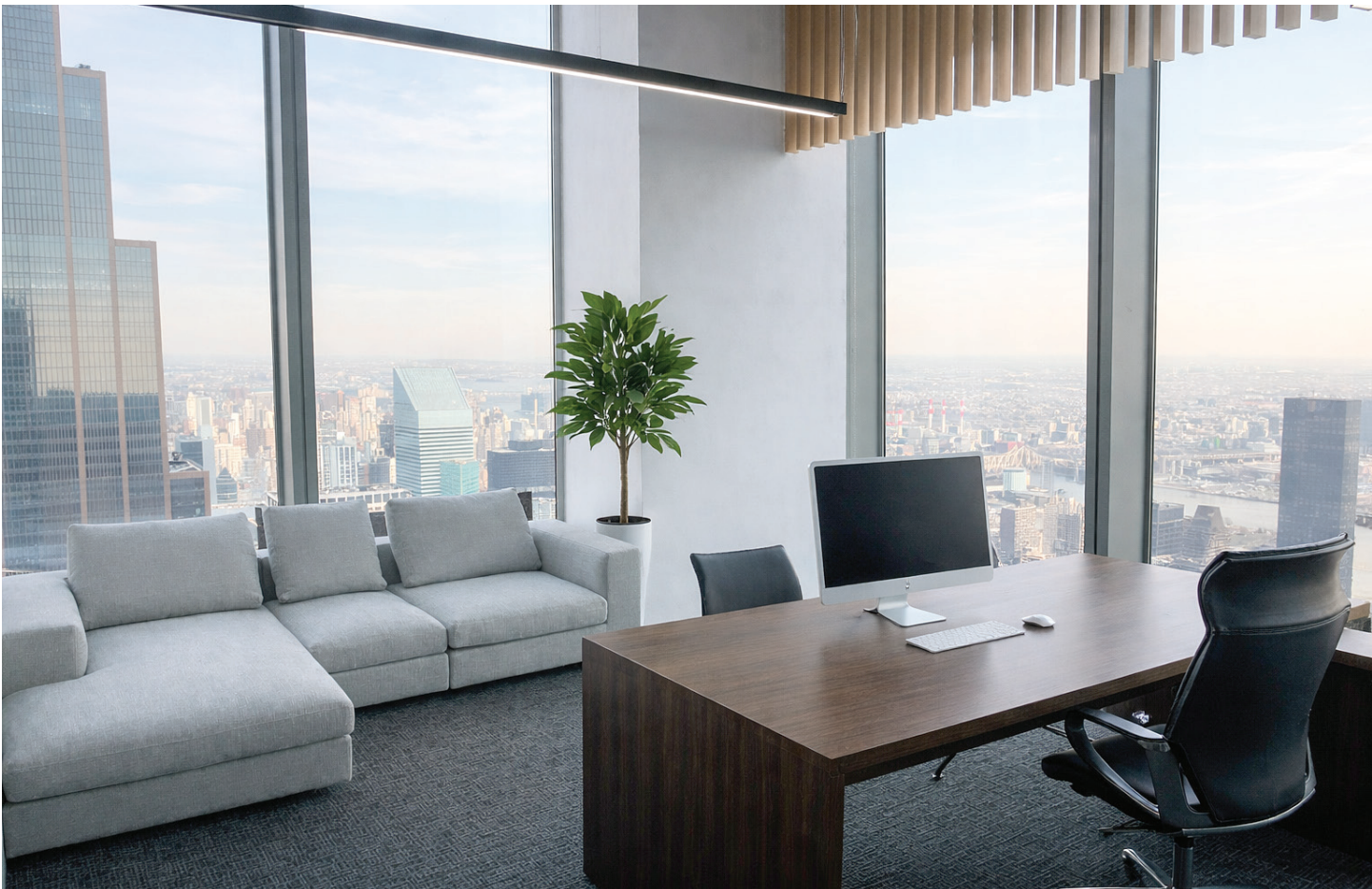
One Vanderbilt Avenue, New York, NY 10017