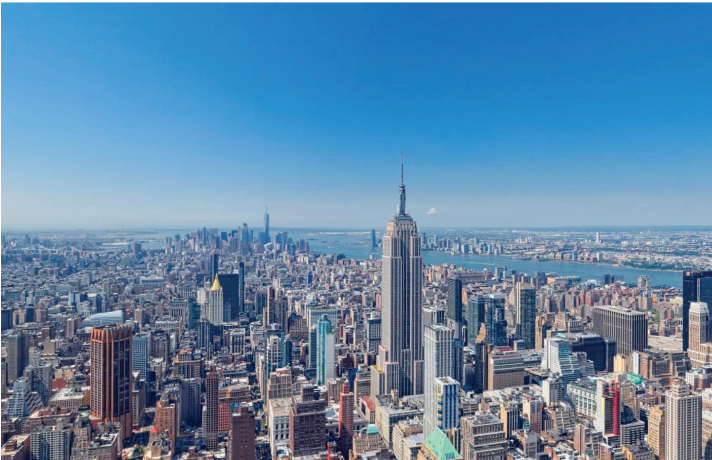
One Vanderbilt Avenue, New York, NY 10017