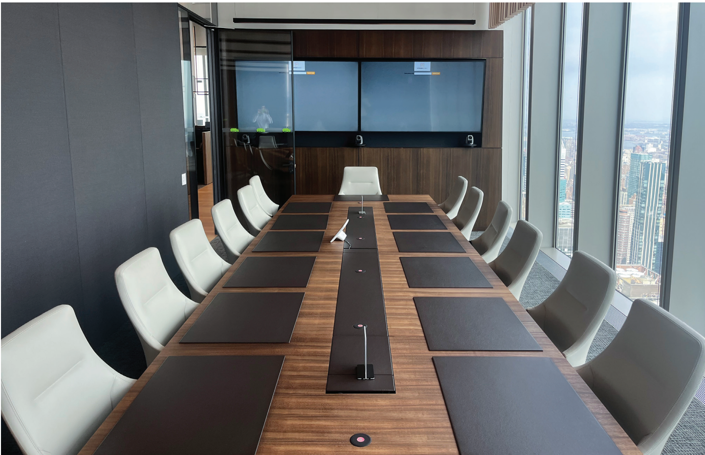
One Vanderbilt Avenue, New York, NY 10017