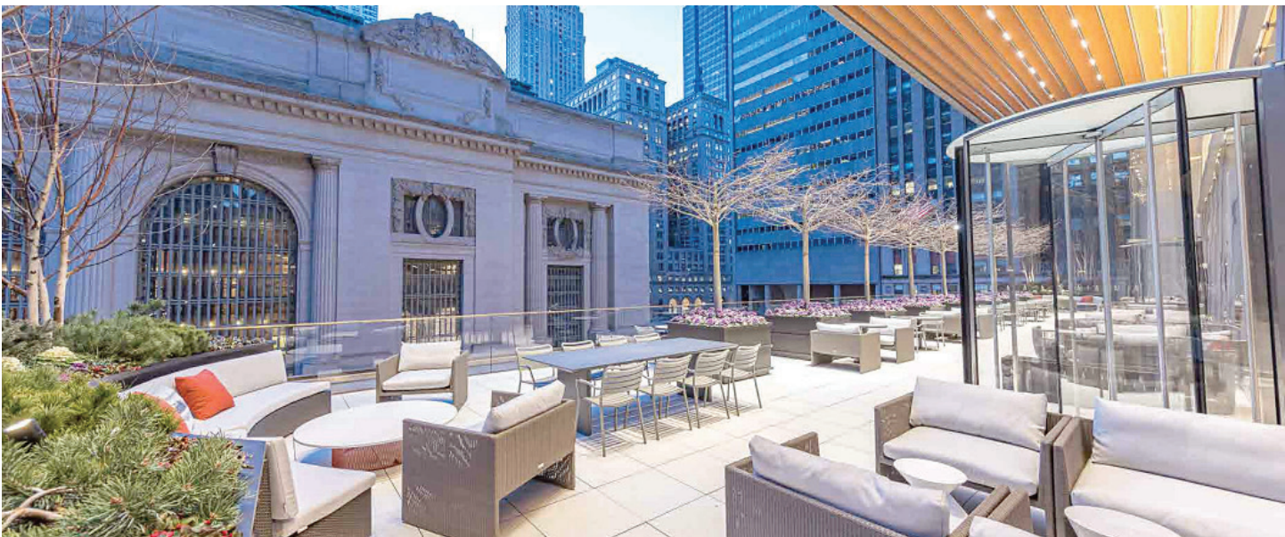
One Vanderbilt Avenue, New York, NY 10017