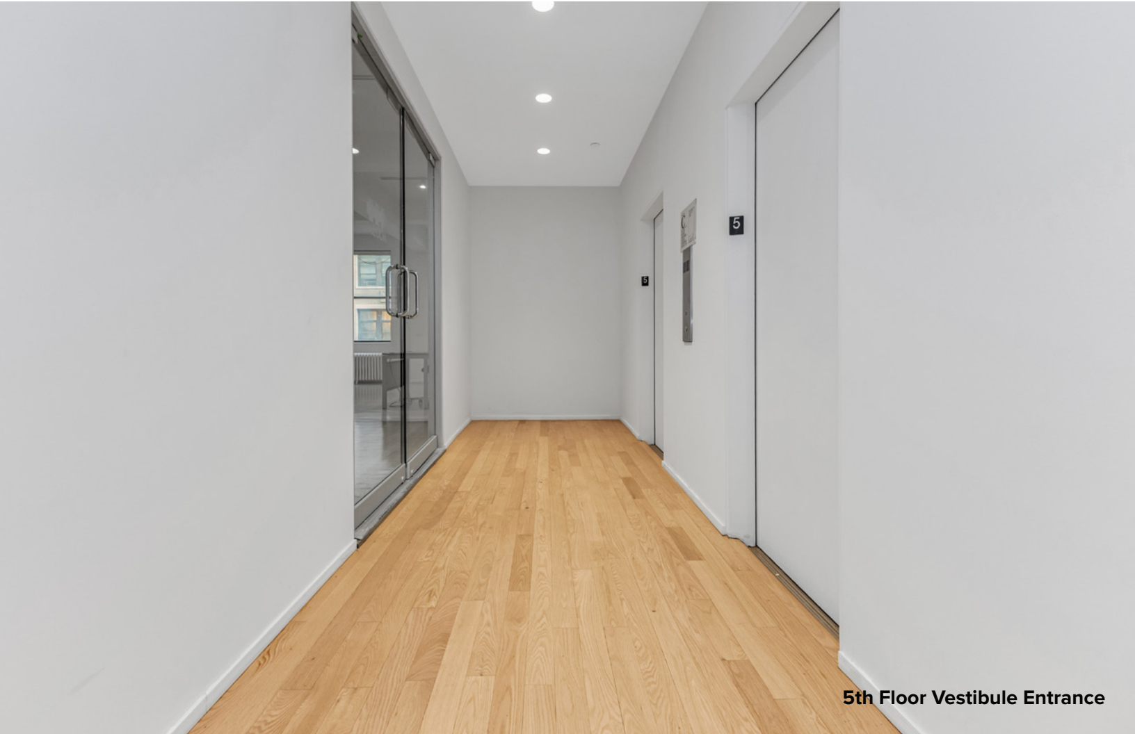
5th Floor Vestibule Entrance