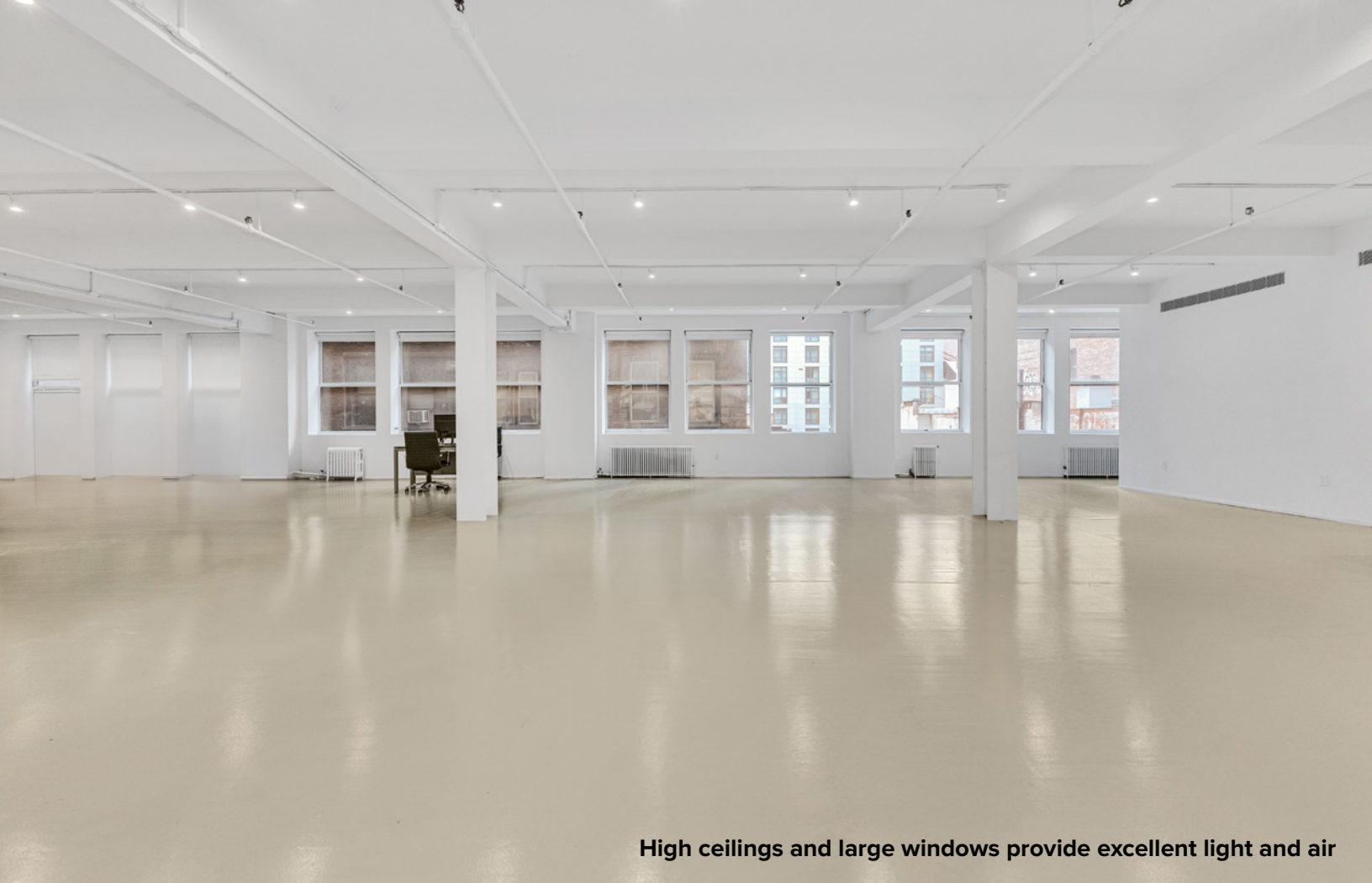
High ceilings and large windows provide excellent light and air