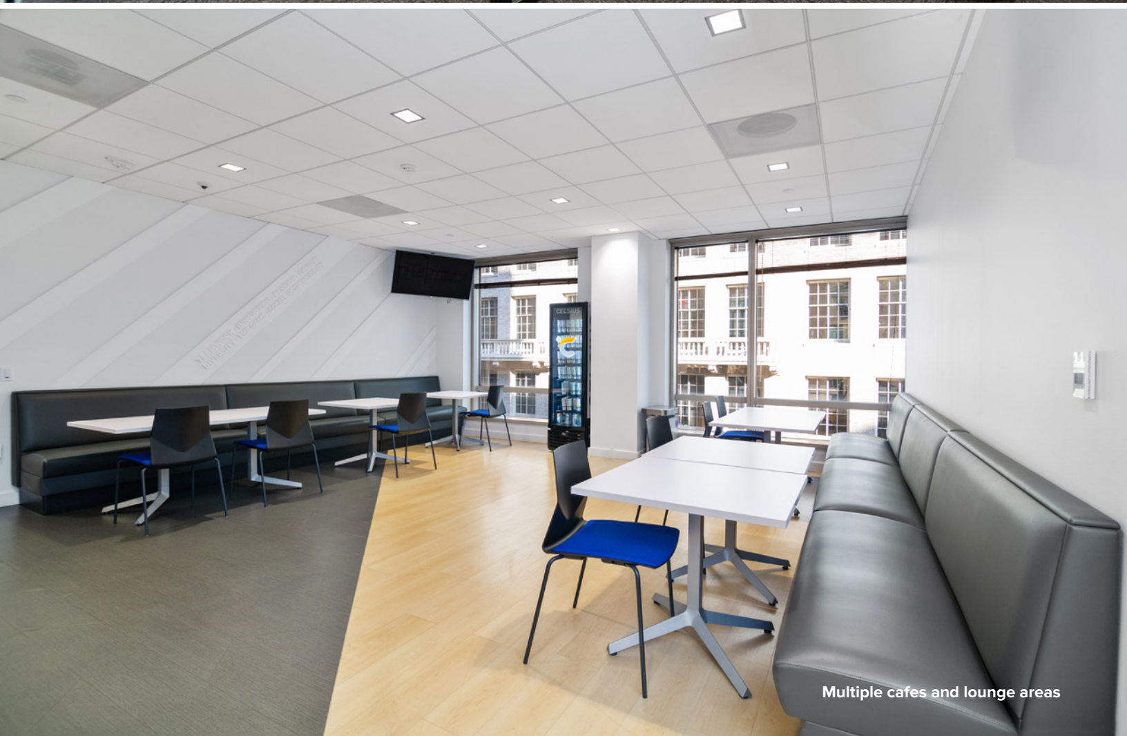
Multiple cafes and lounge areas