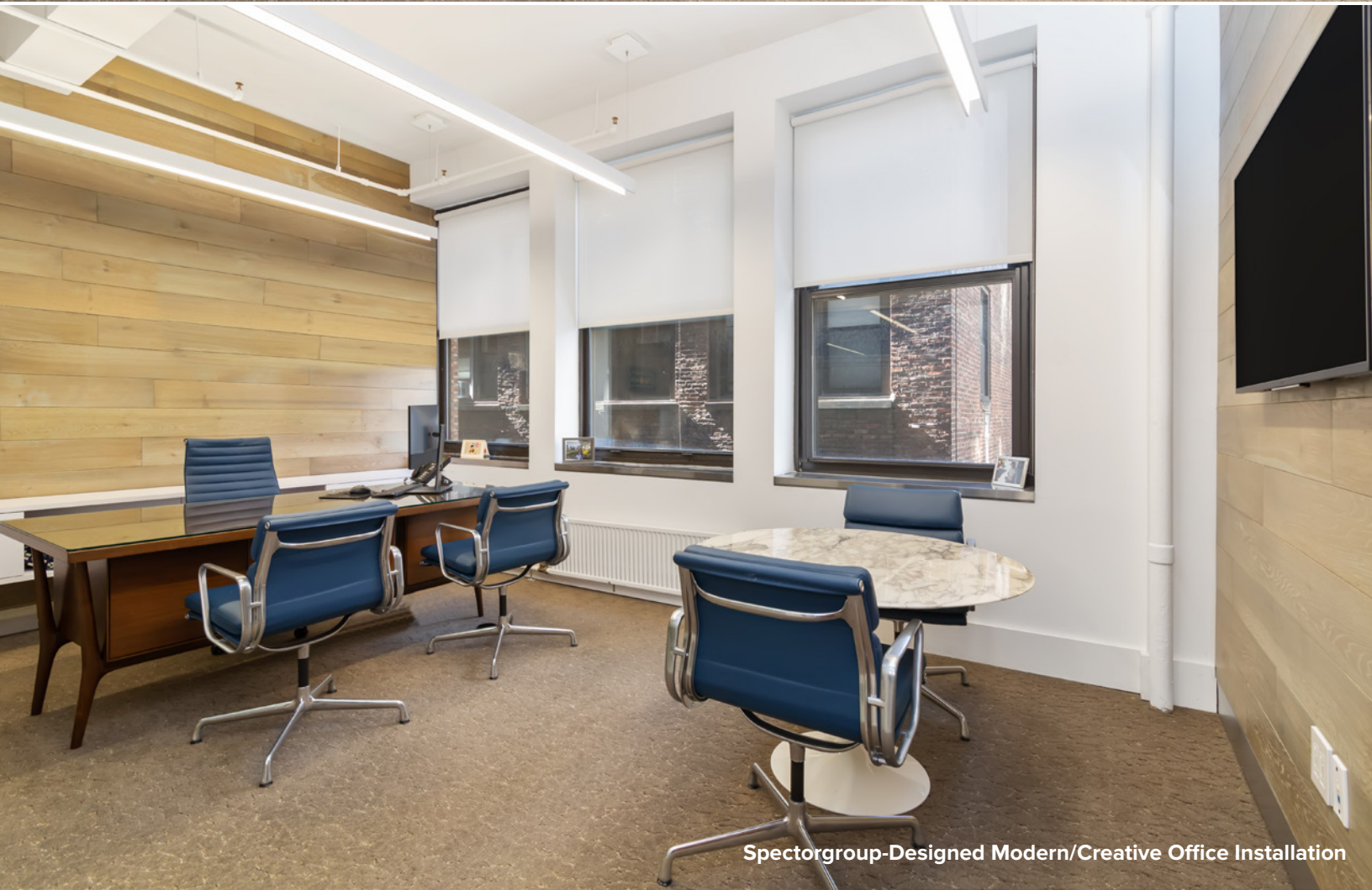
Spectorgroup-Designed Modern/Creative Office Installation