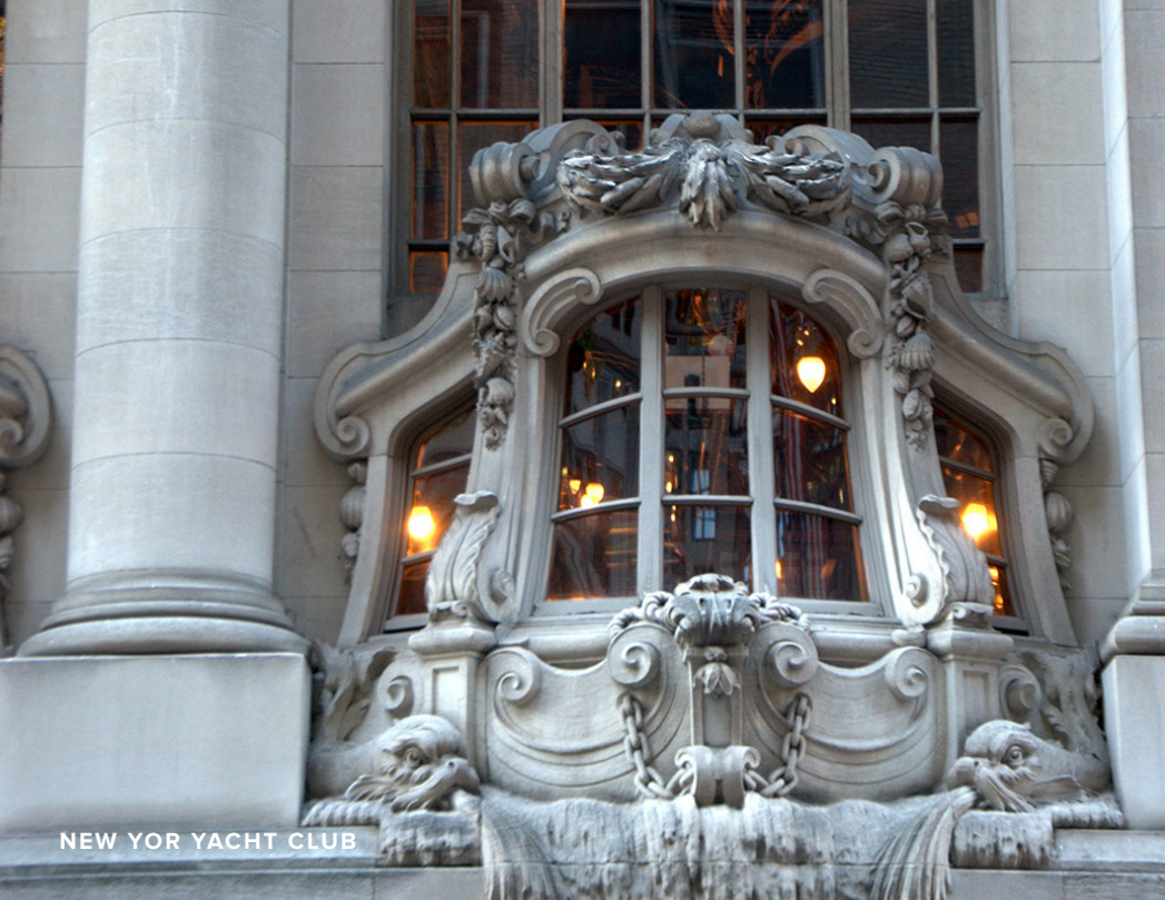
NEW YORK YACHT CLUB