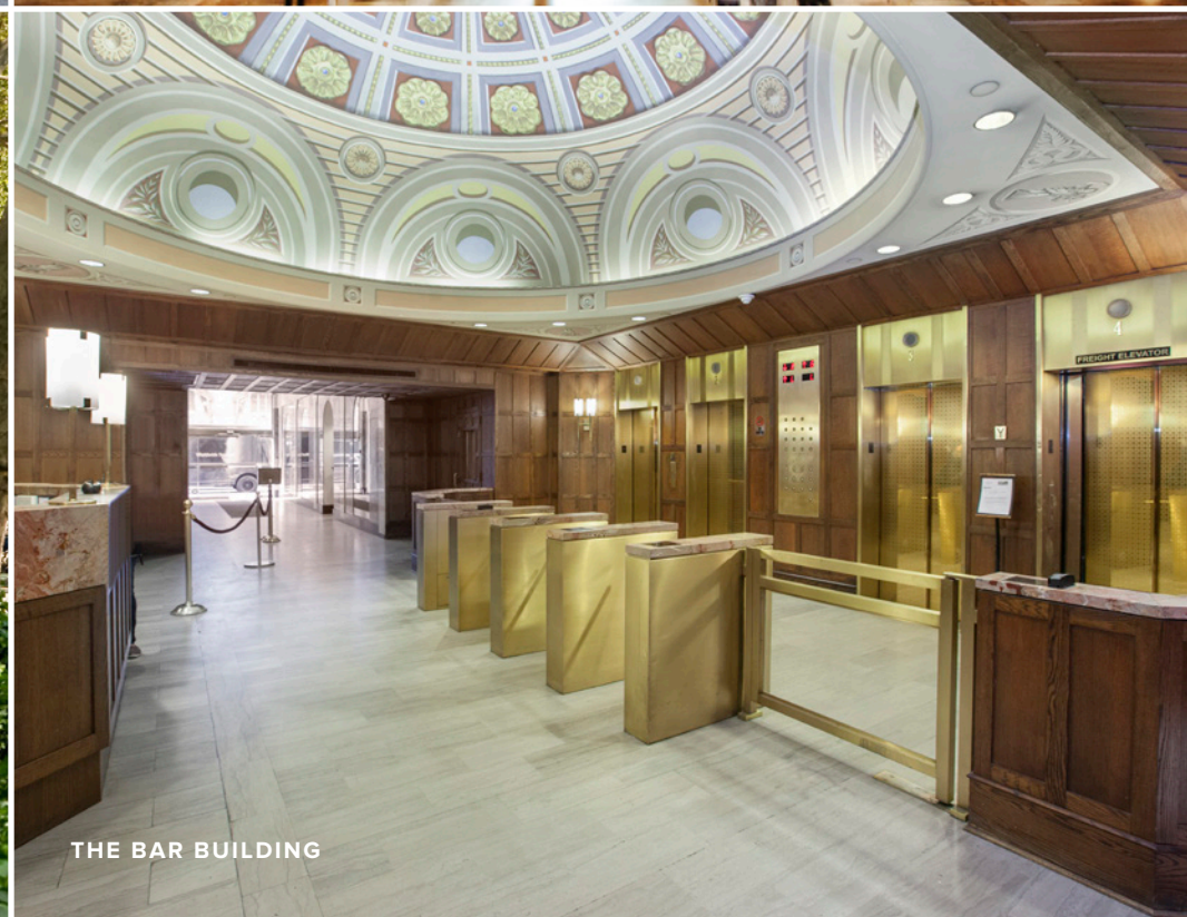
THE BAR BUILDING