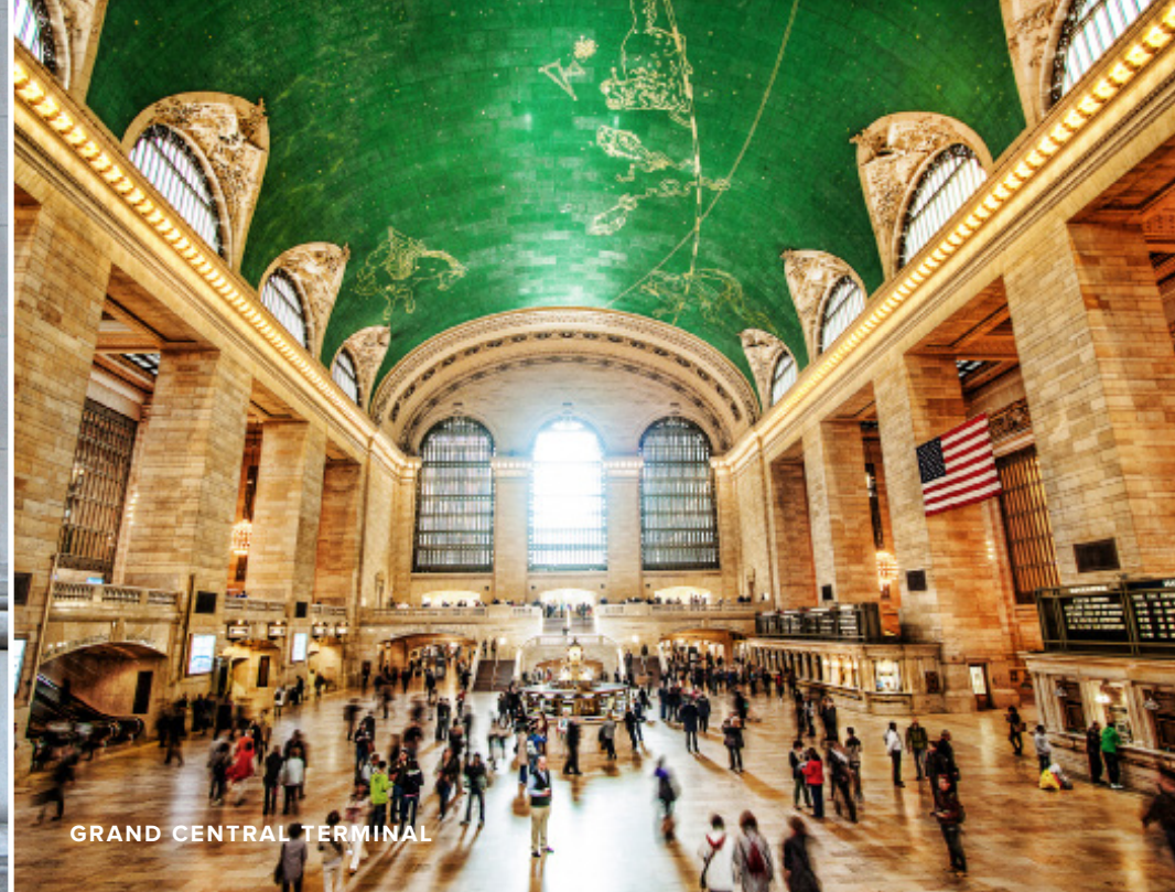
GRAND CENTRAL TERMINAL