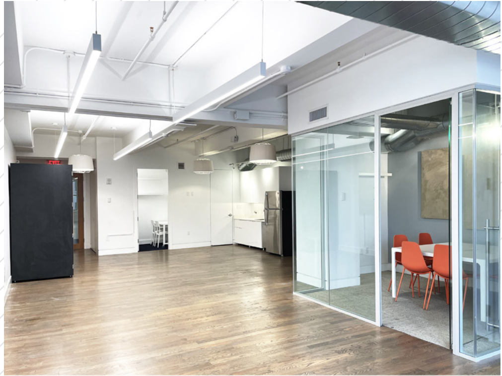
Suite 1204 - Existing Conditions