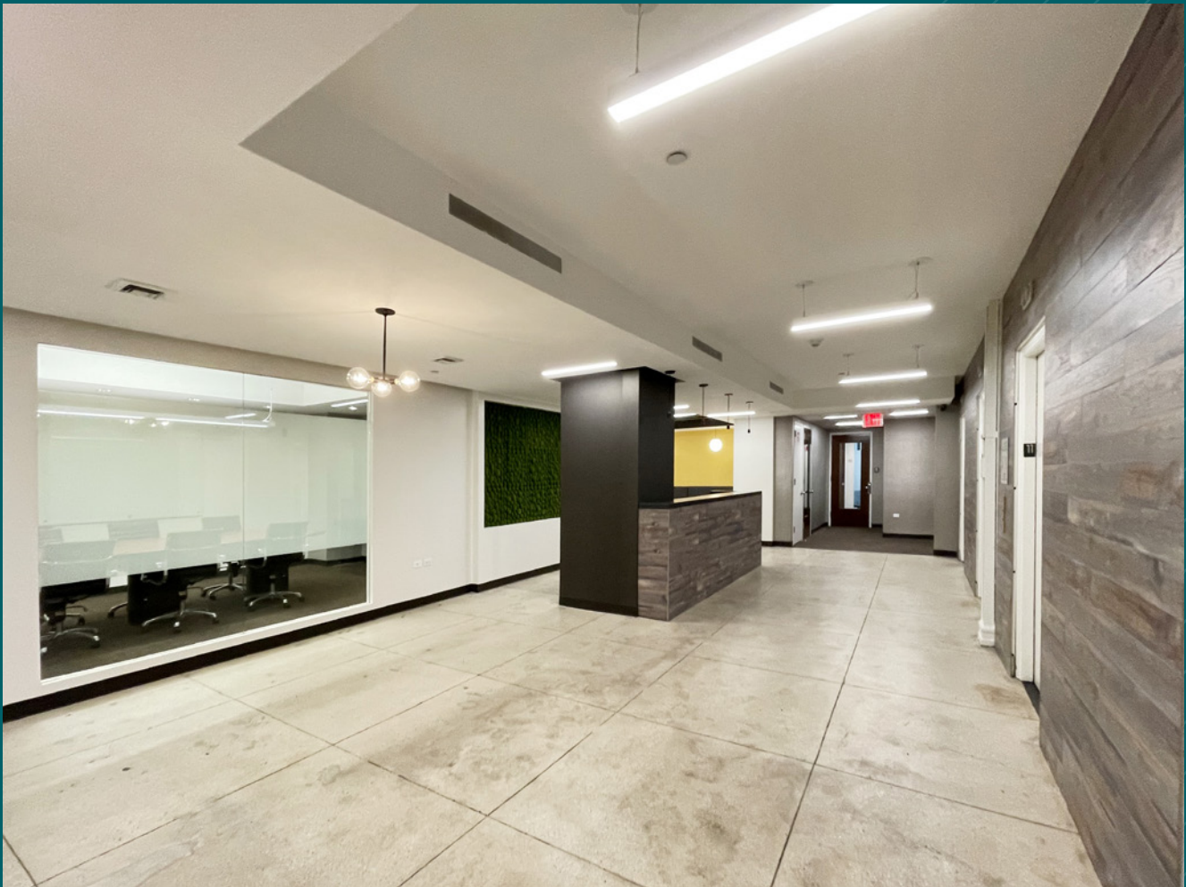
Entire 11th Floor - Existing Conditions