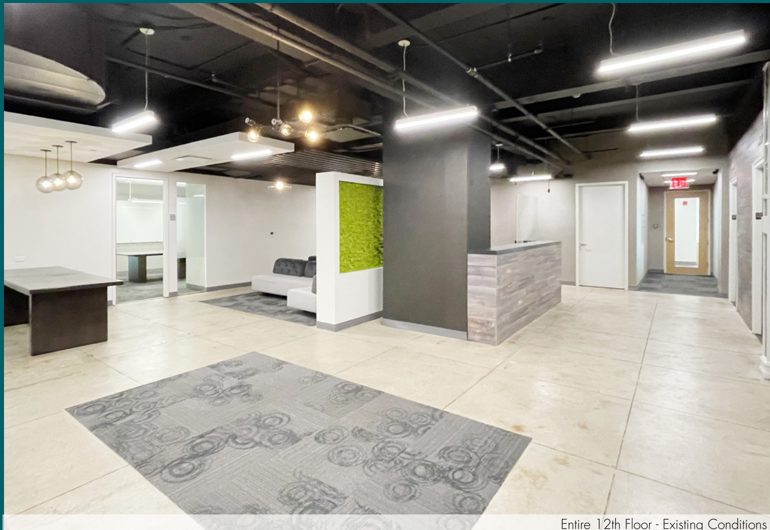
Entire 12th Floor - Existing Conditions