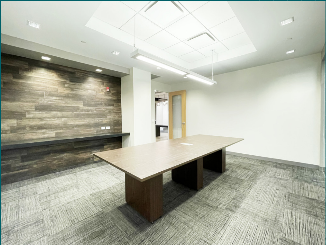
Entire 12th Floor - Existing Conditions