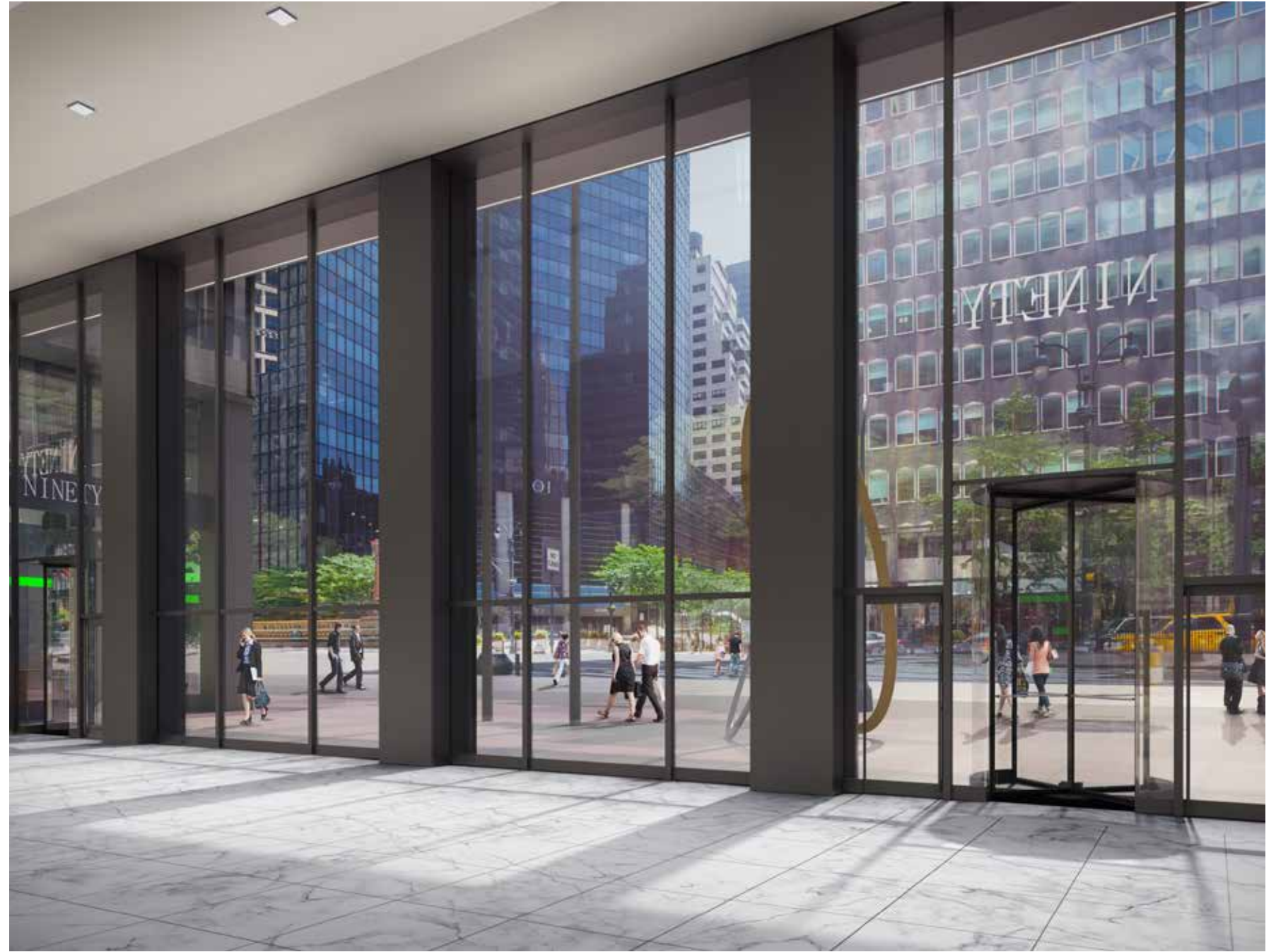
New Lobby Storefront and Entrance (Artist Rendering)