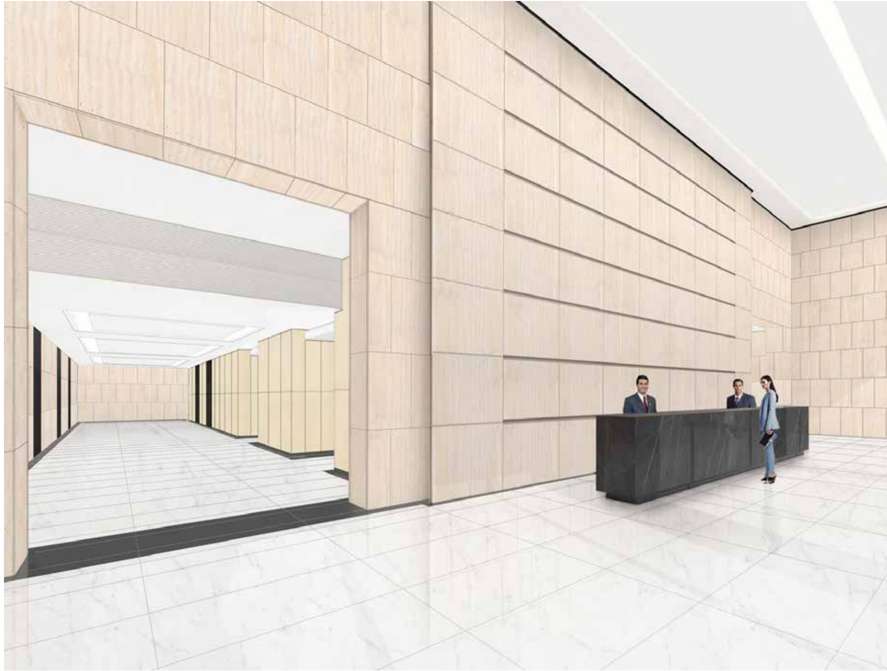
Renovated Lobby Interior (Artist Rendering)