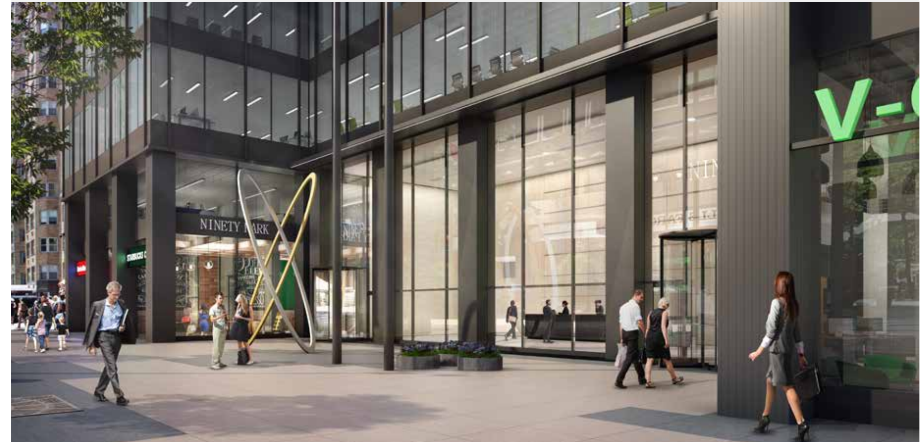
New Lobby Storefront and Entrance (Artist Rendering)