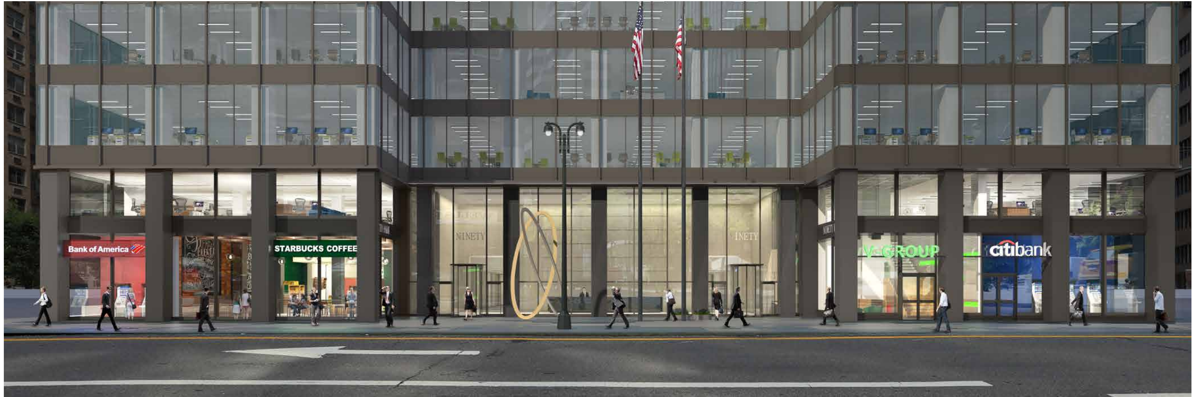
New Lobby Storefront and Entrance (Artist Rendering)