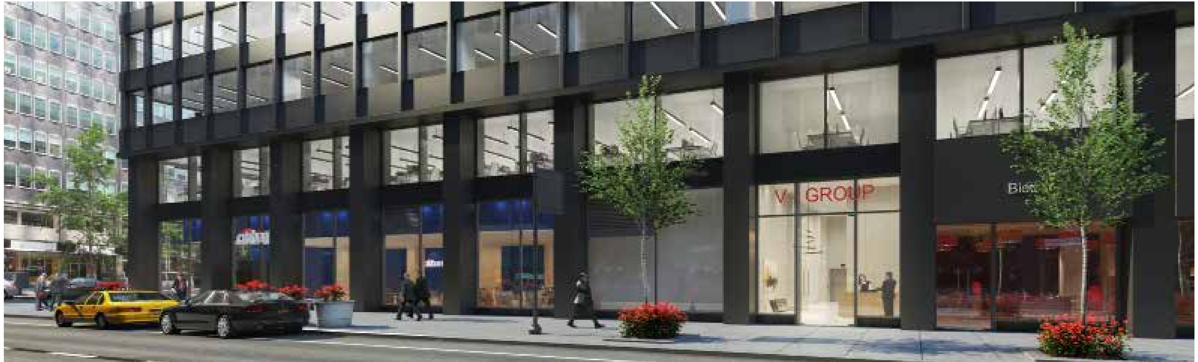
Private Tenant Lobby on 40th Street