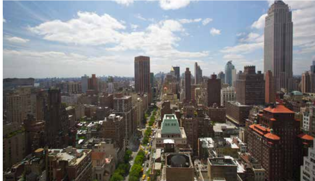
Tower Floor Views