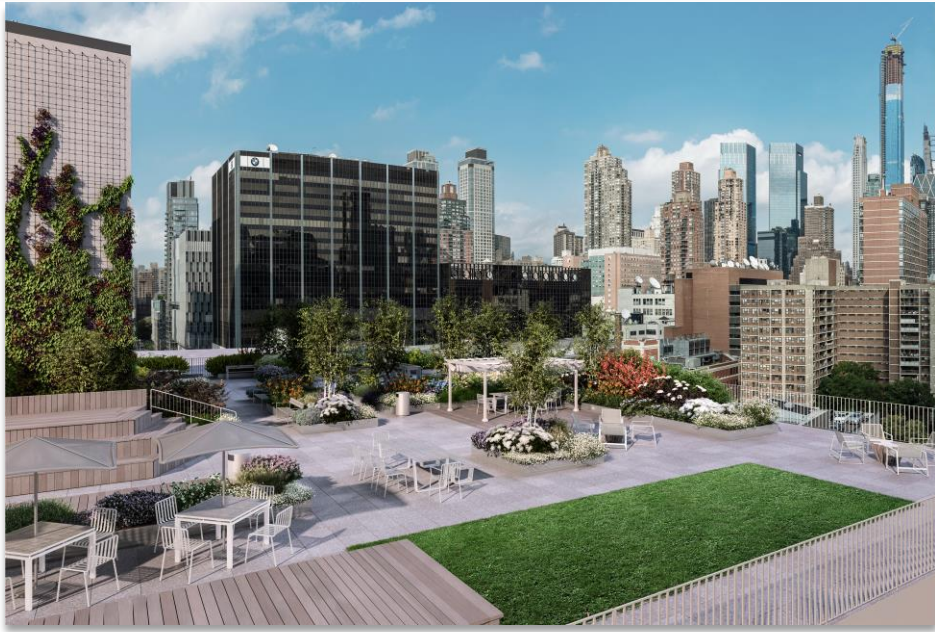
787 Eleventh Avenue Roof Deck