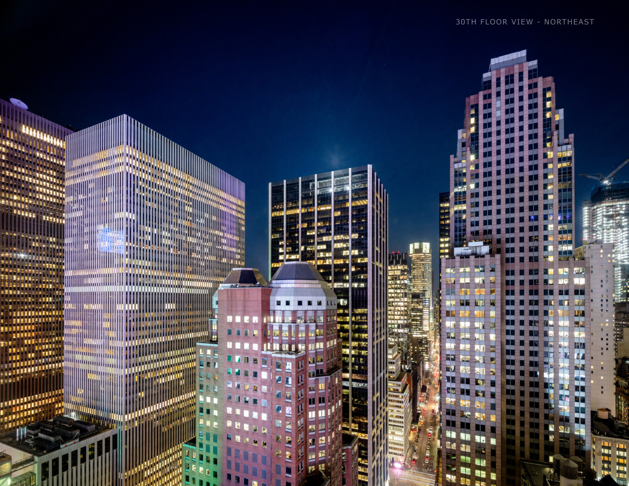
30TH FLOOR VIEW - NORTHEAST