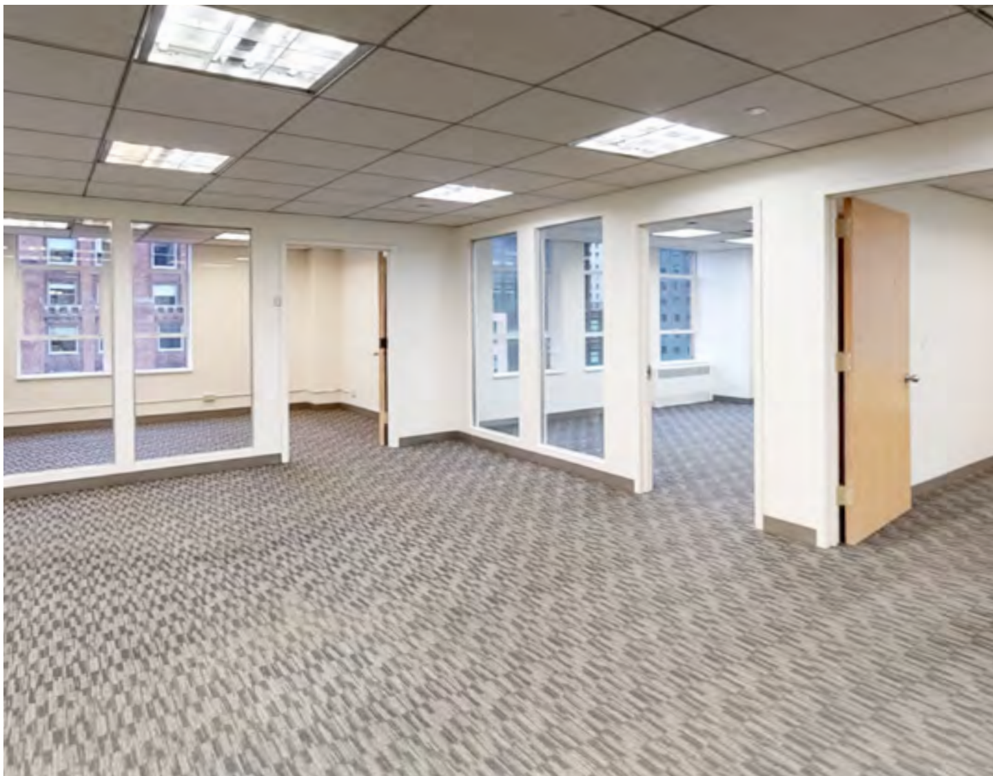
Partial 20th Floor (S)