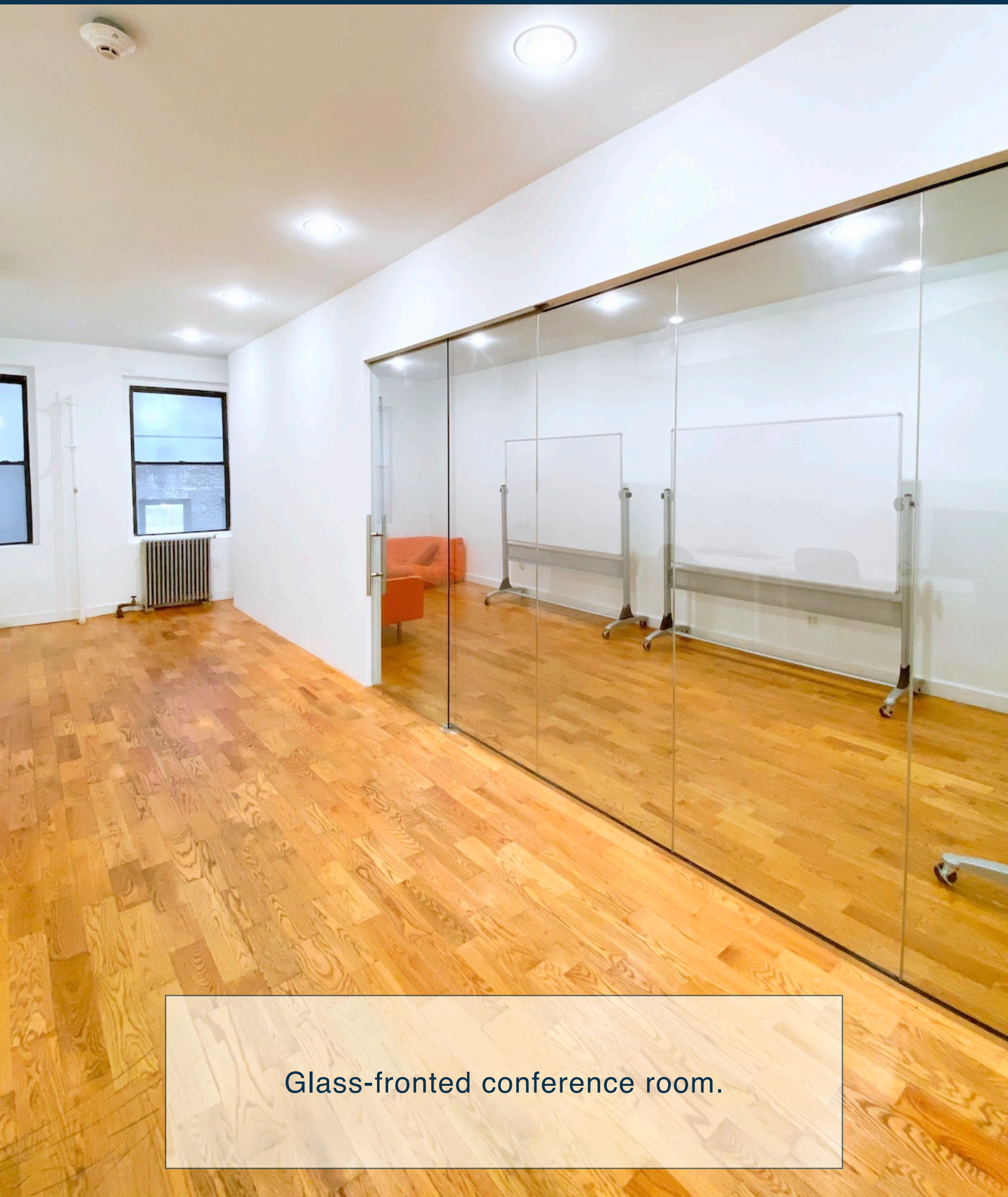
Glass-fronted conference room.