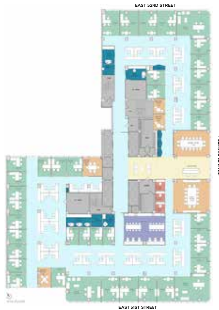
PRIVATE OFFICE LAYOUT