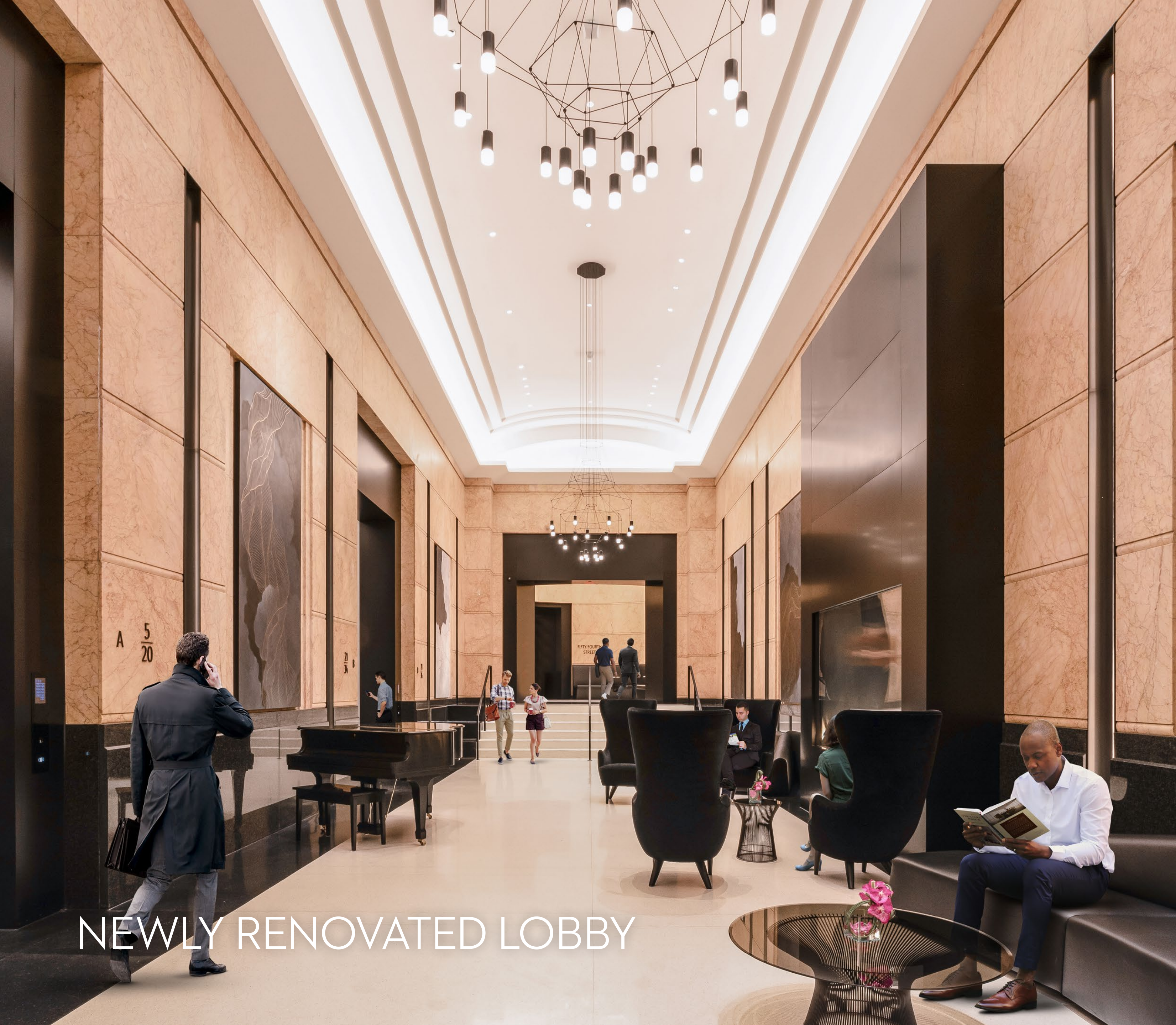
NEWLY RENOVATED LOBBY