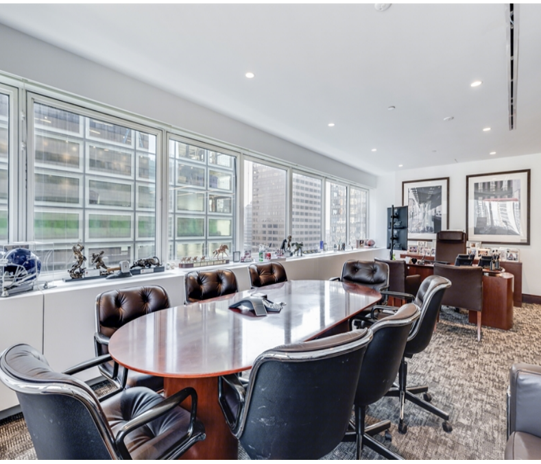
Executive Office 2