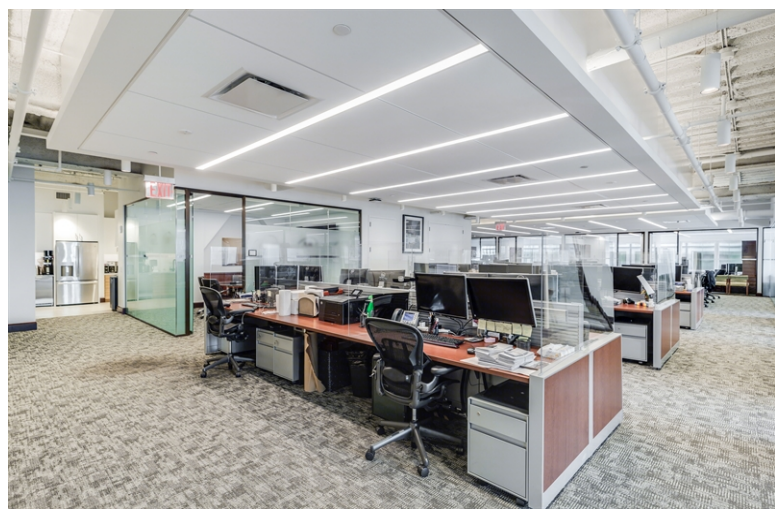
Open Area 2