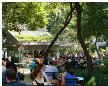
Madison Square Park