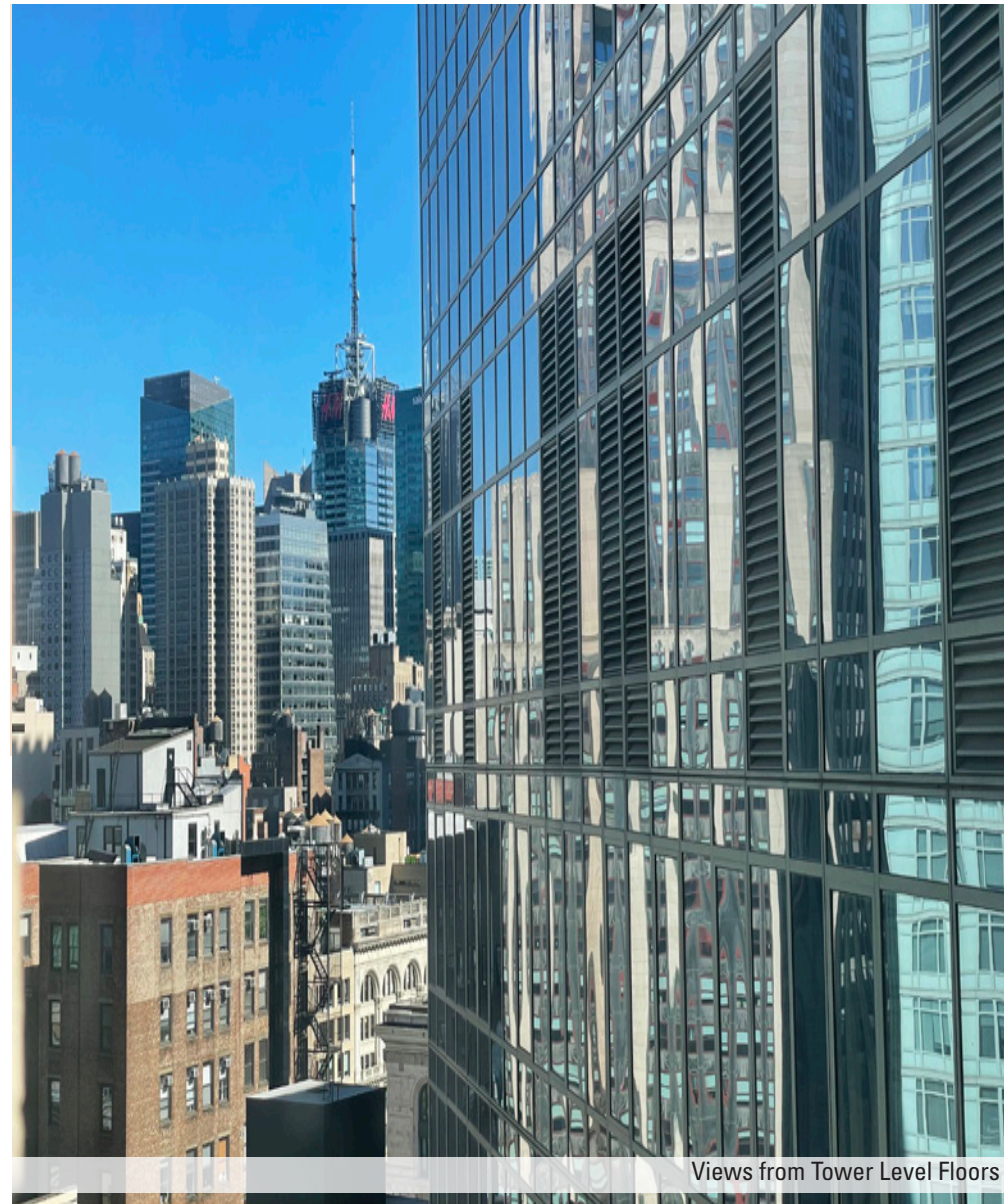
Views from Tower Level Floors

Entire 20th Floor: 3,340 RSF Upon Req. Immediate