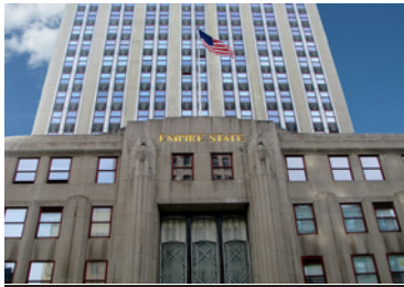
Empire State Building