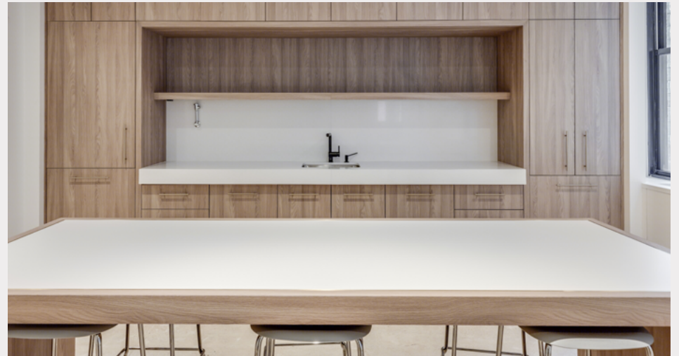
Pre-Built—Standard Design and Finishes