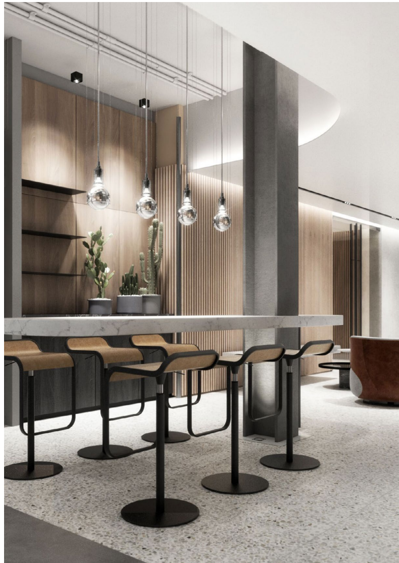
Space rendering, breakfast nook