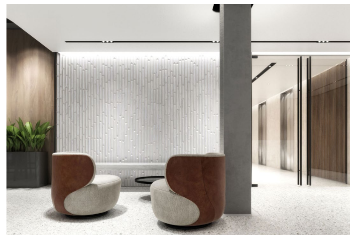
Space rendering, arrival lounge