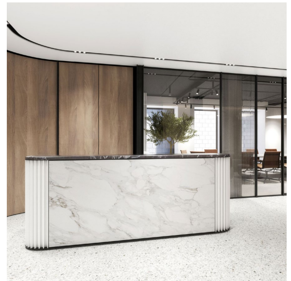
Space rendering, reception desk