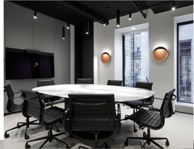
4th floor conference room