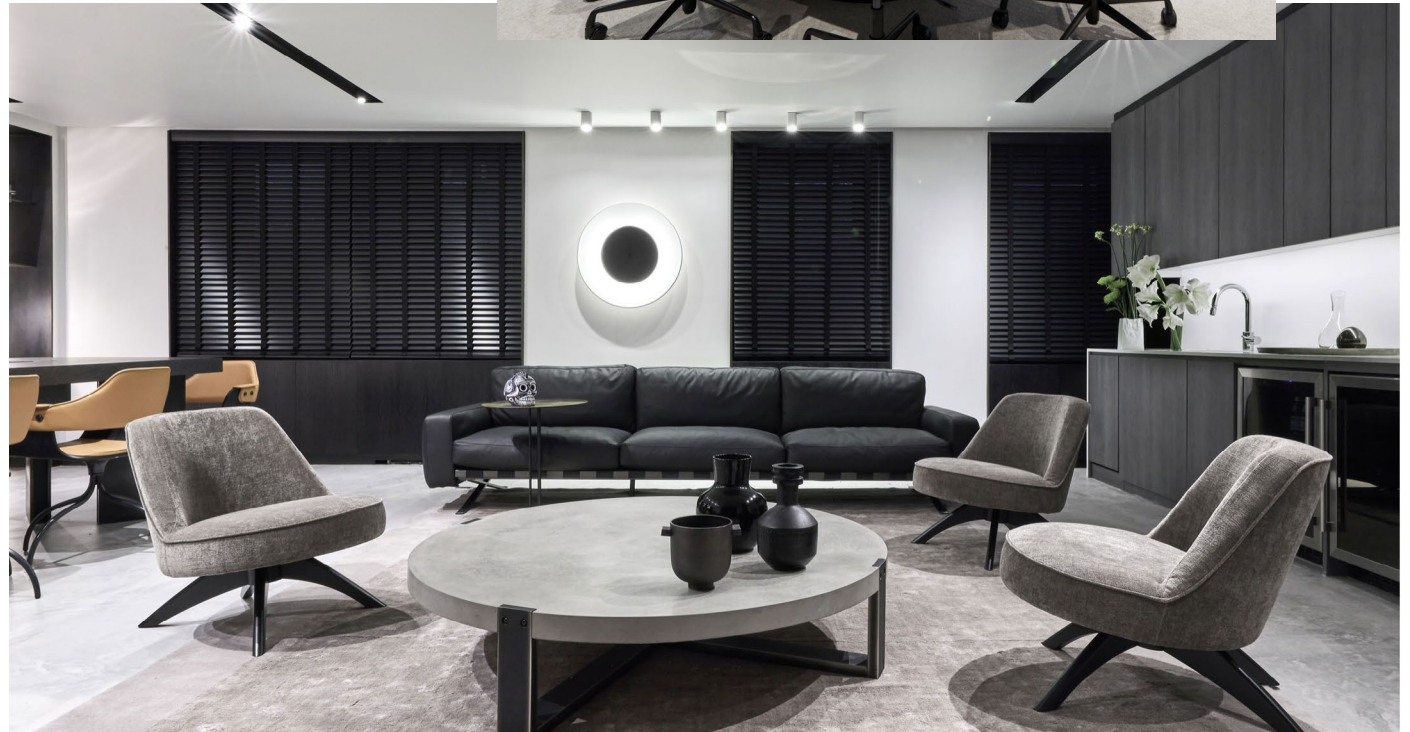
4th floor private lounge and event space