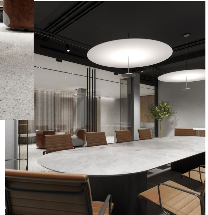
Space rendering, conference room