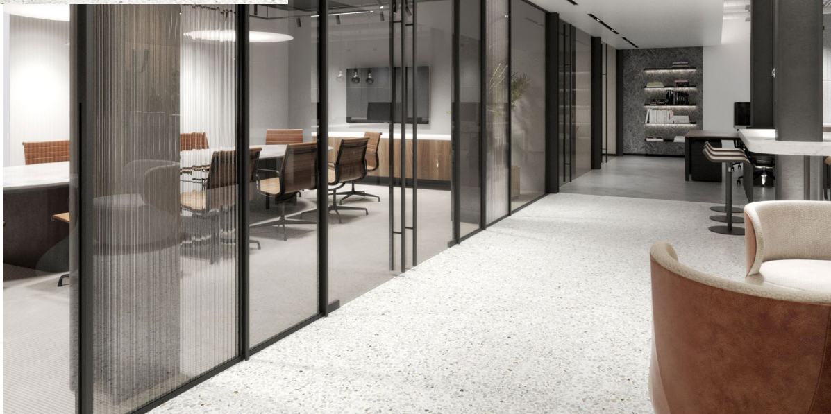
Space rendering, conference room and hallway