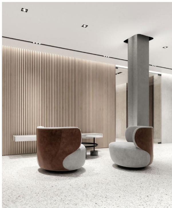
Space rendering, arrival lounge