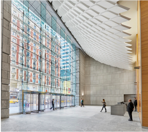
42 ND STREET LOBBY