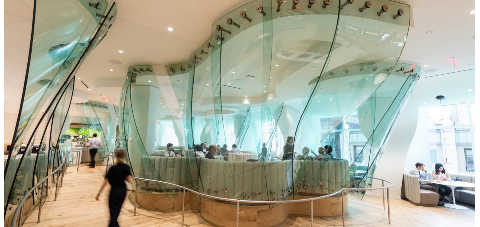
WELL & AMENITY FLOOR