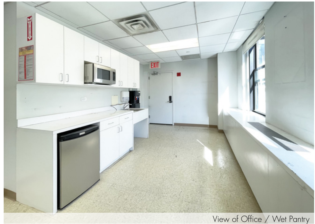
View of Office / Wet Pantry