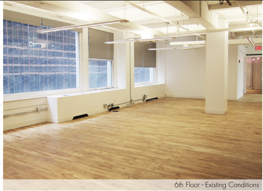
6th Floor - Existing Conditions