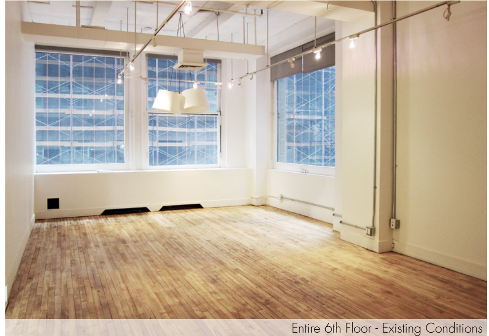
Entire 6th Floor - Existing Conditions

Partial 5th Fl: 4,376 rsf May 1, 2022 Upon Request - Built space with multiple offices, (1) conference room, bullpen area accommodating 30 workstations, wet pantry, reception area, and storage room